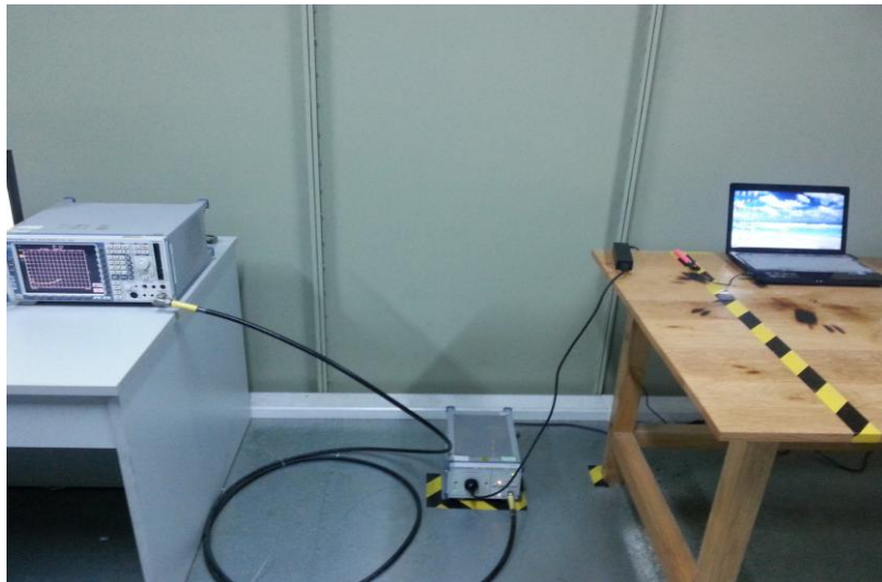
Conducted Emission (AC Mains)