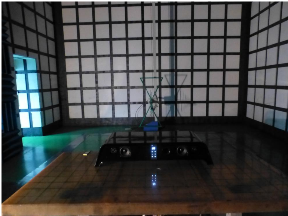
Radiated Emission Below 1GHz