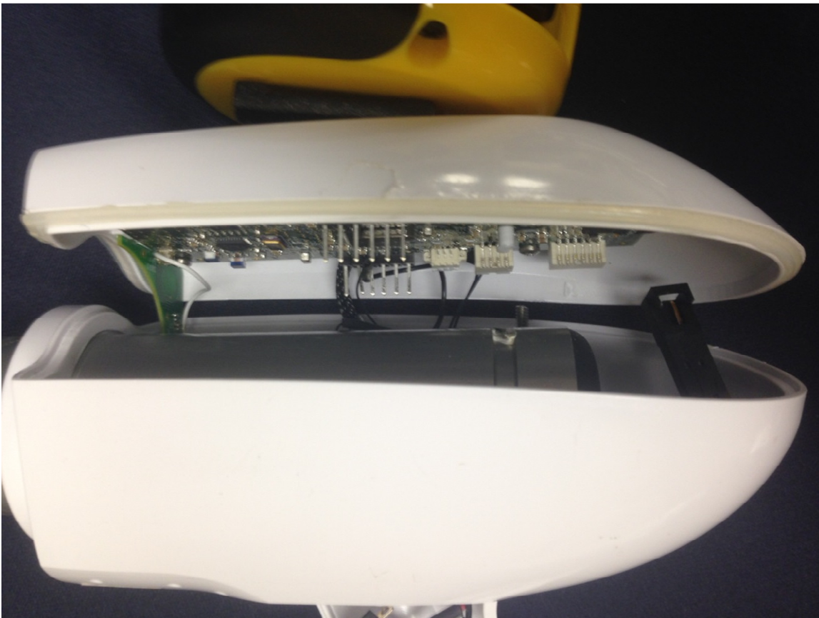
Figure 4: RF Board Position inside TW