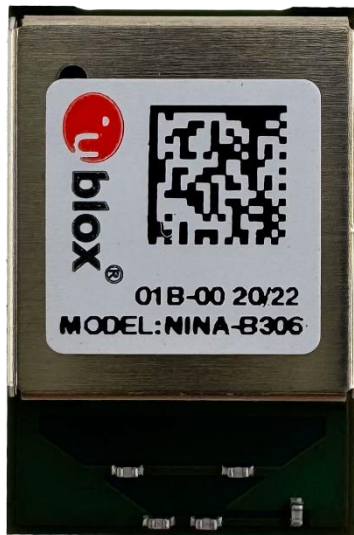
Figure 1: UBlox NINA-B306 Top

To be able to fit the FCC/IC certification number on the label the size has to be smaller than 4 points. Using such small font size makes the certification number too small to be readable. Therefore, in accordance with CFR 47 §2.925 (f) and consistent with u-blox AG's original approval the FCC ID and ISED Certification Number is not printed on the label, but instead placed in the user manual.