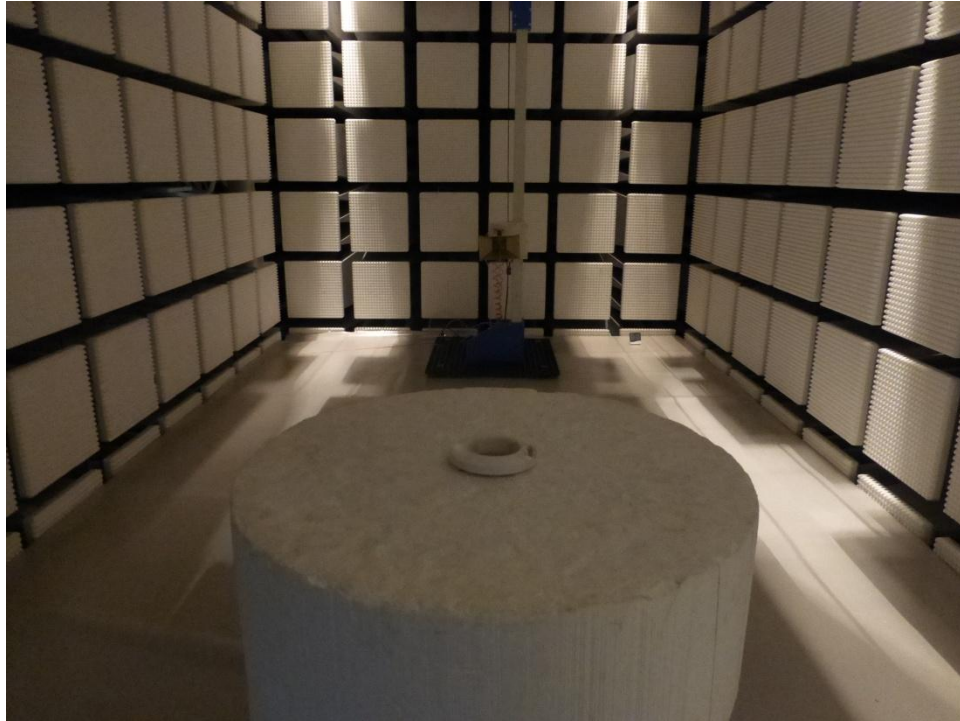
Spurious Emission above 1GHz