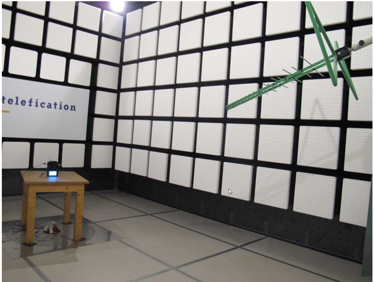
Photograph 1: Radiated emissions test set up, 30 – 1000 MHz