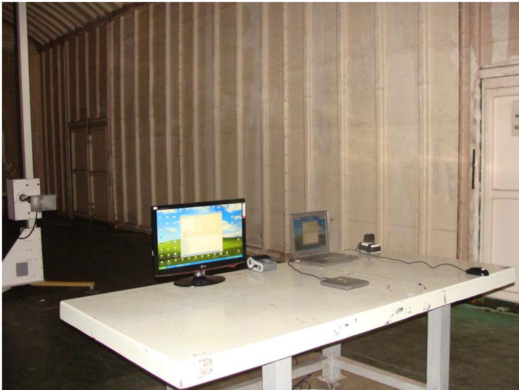
Back View of Radiated Test (Horn)