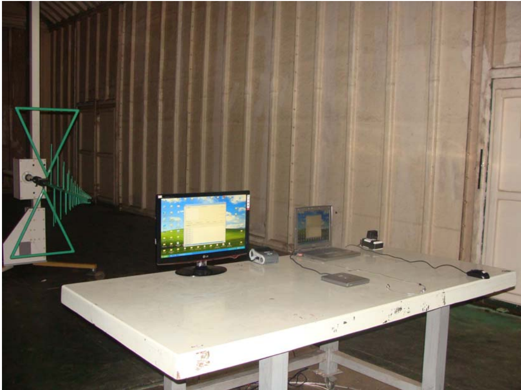
Back View of Radiated Test