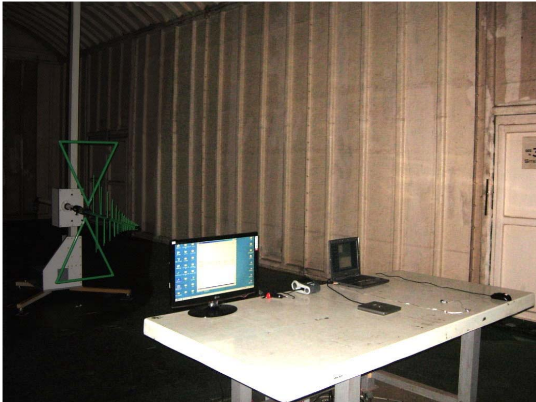
Back View of Radiated Test - (DC Charger)