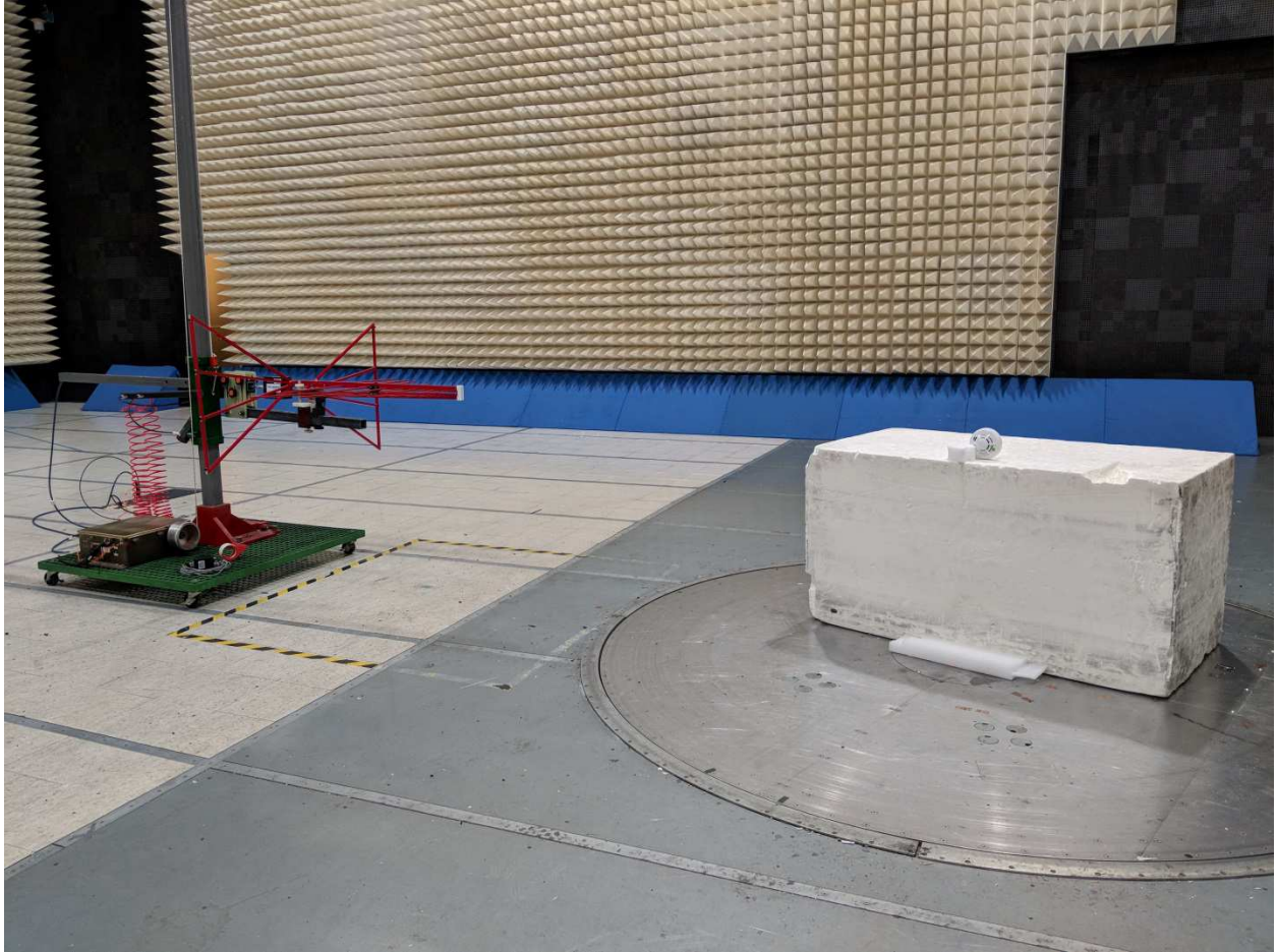
Radiated Emissions below 1GHz