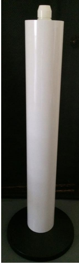
Front View – Stanchion - Kezar unit will typically be placed on stanchion during operation.