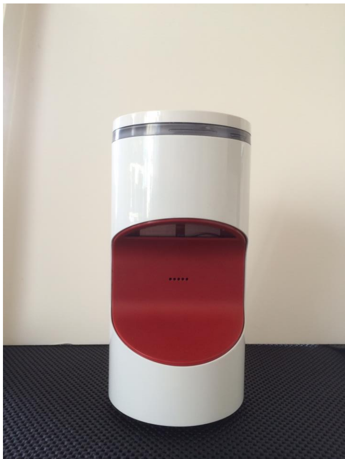
Front of Kezar Unit