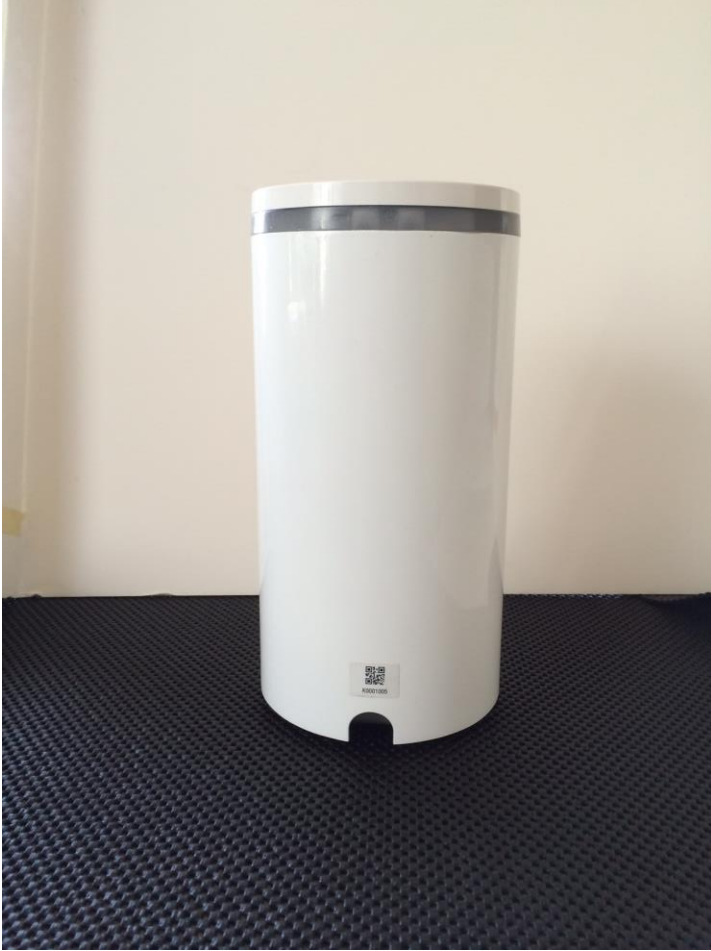
Rear of Kezar unit