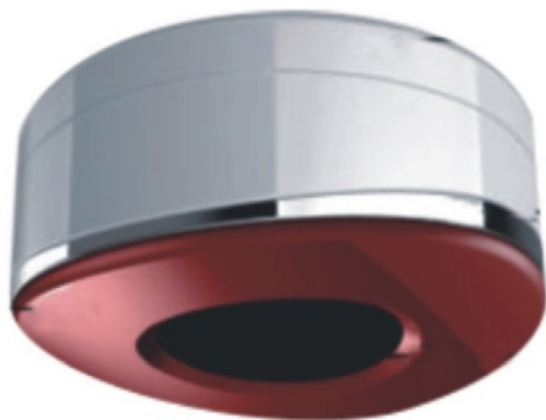
Siren ( GR-304N )

Thank you for choosing GR.SMARTHOME products, the manual can be your guidance of installation and function features, it can help you to use our products completely and flexibly. Please keep it in good condition.