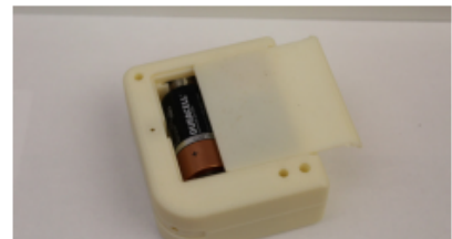
REPLACE BATTERIES AND SLIDE SHUT