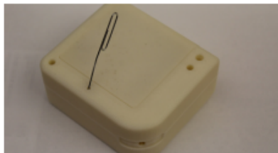
OPEN BATTERY COMPARTMENT