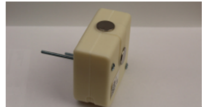
WITH SECURITY BOLTS