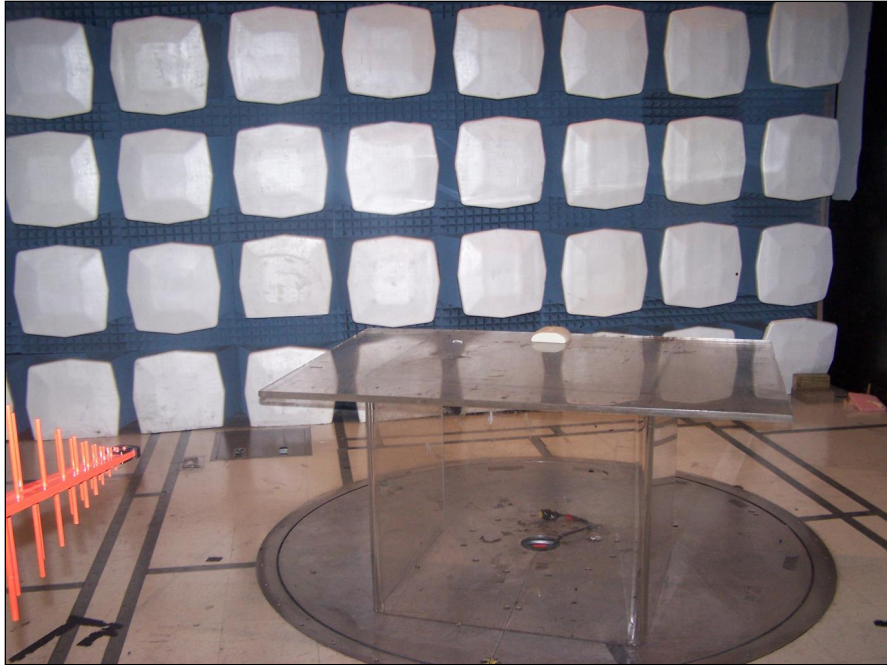
Photograph 2. Radiated Spurious Emissions, Test Setup, 30 MHz – 1 GHz