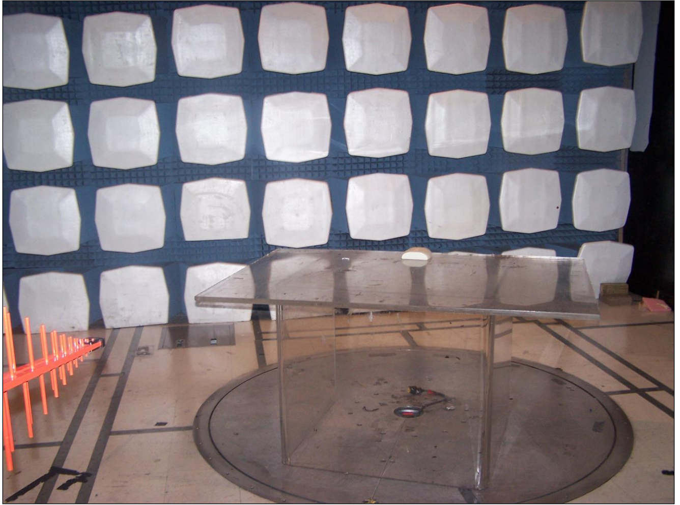
Photograph 1. Radiated Emissions, Test Setup