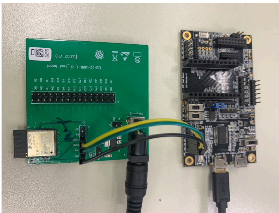
Figure 2: Hardware Connection