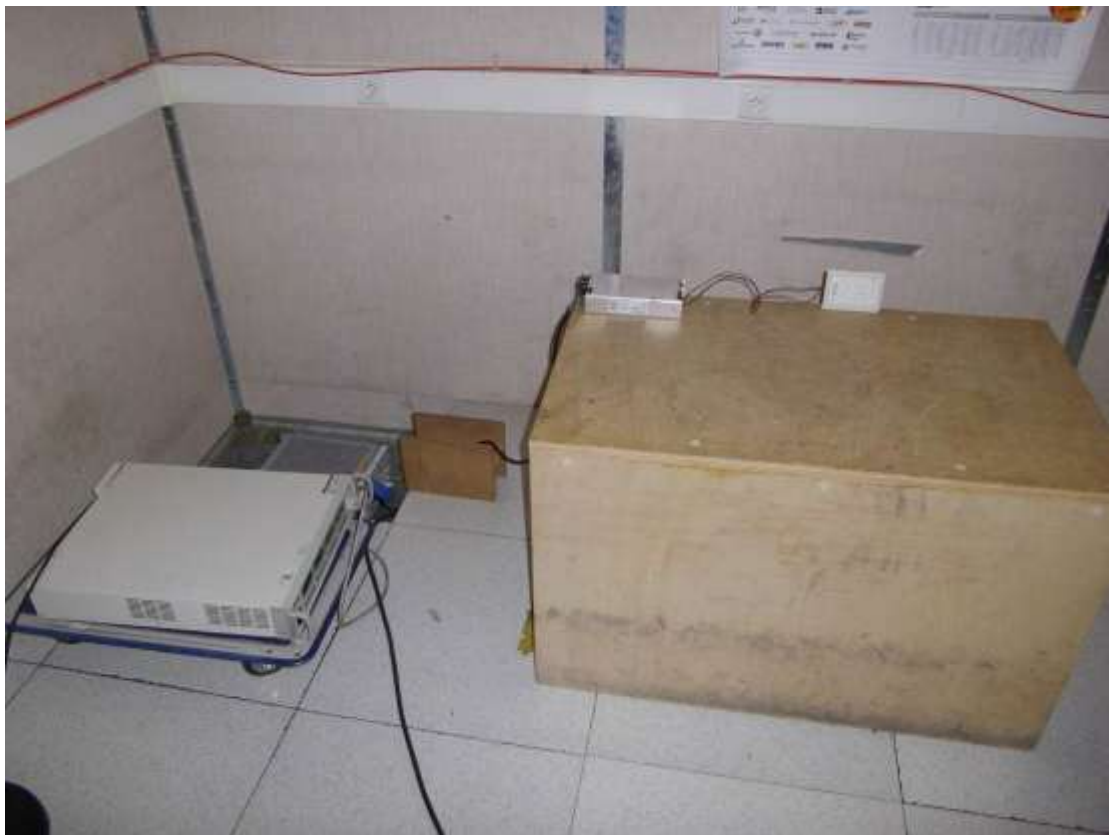
Test setup for AC Power Line Conducted Emissions (Front view)