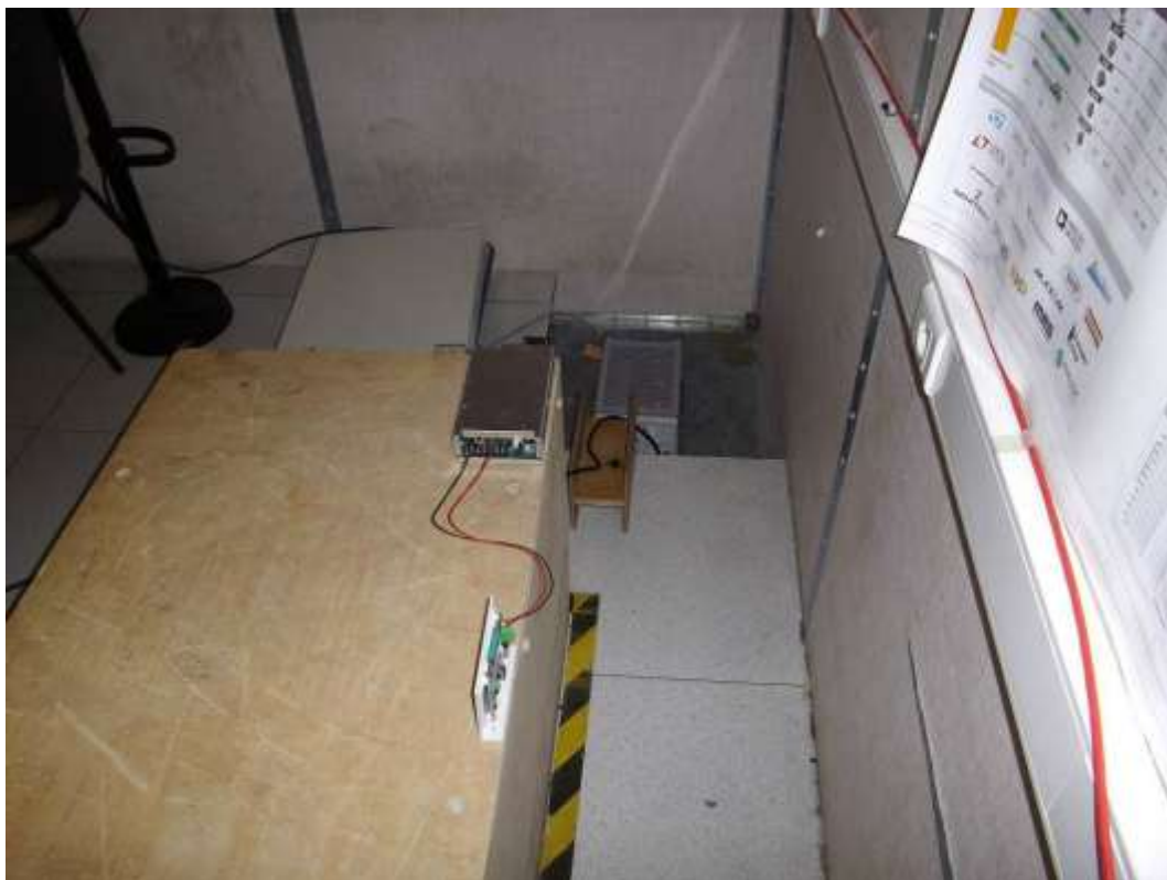
Test setup for AC Power Line Conducted Emissions (Rear view)