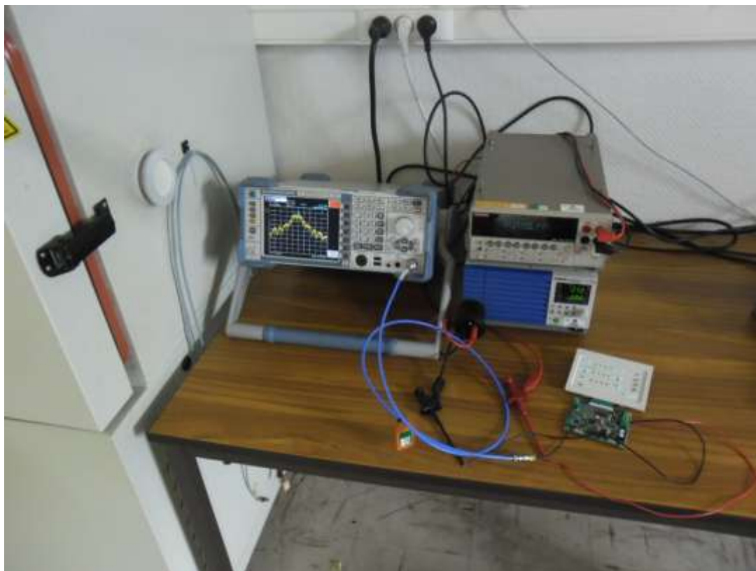
Test setup for Power Spectral Density