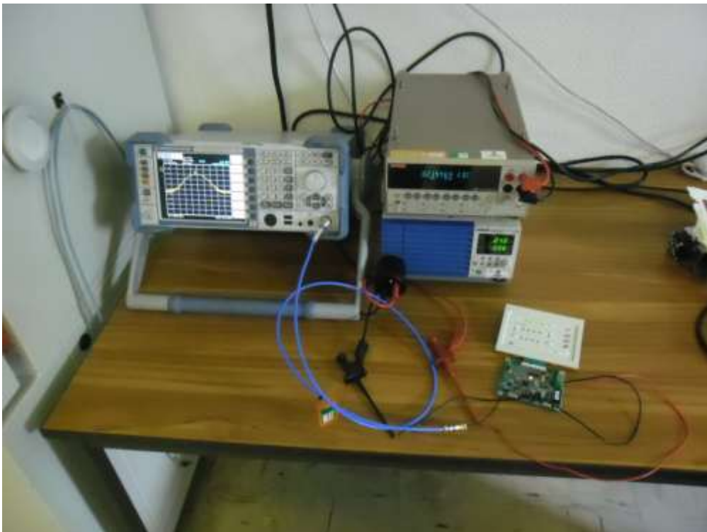
Test setup for Maximum Conducted Power