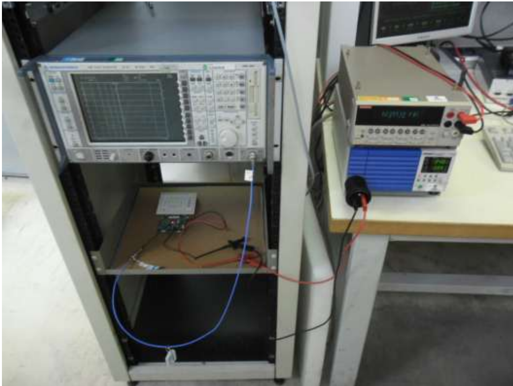
Test setup for Unwanted Emissions into Non-Restricted Frequency Bands