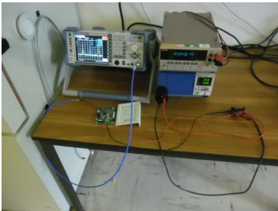
Test setup for Unwanted Emissions into Non-Restricted Frequency Bands At the Band Edge