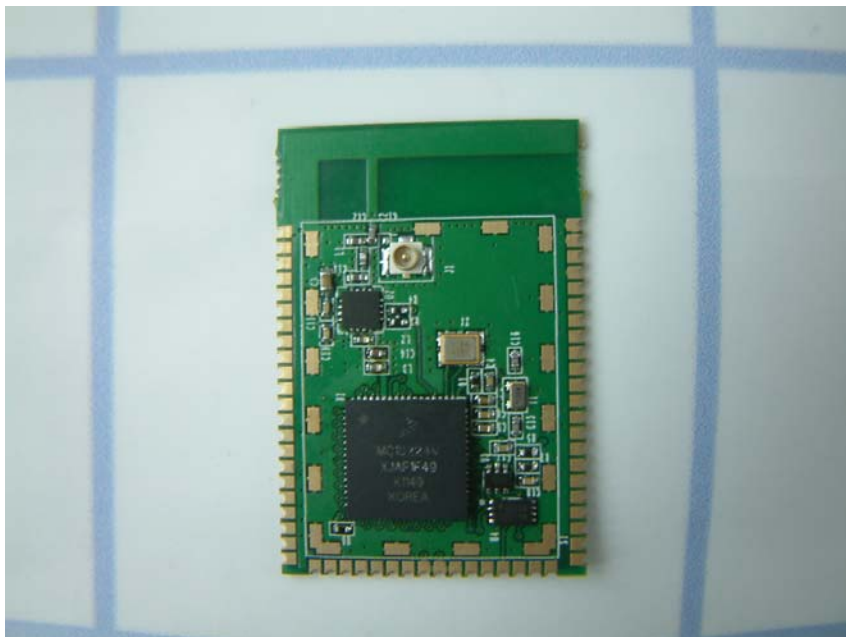
PCB Side 1 View

Copyright of this report is owned by Centre of Testing Service and may not be reproduced other than in full except with the written approval of the issuing Company.