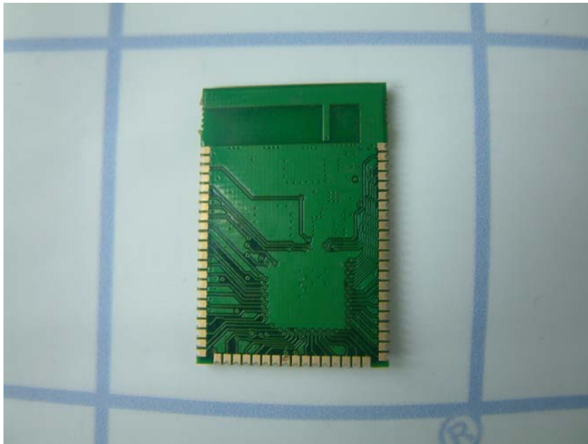
PCB Side 2 View