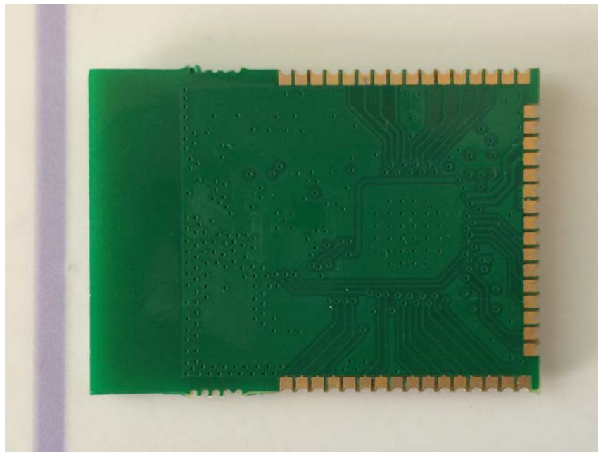
PCB Side 2 View