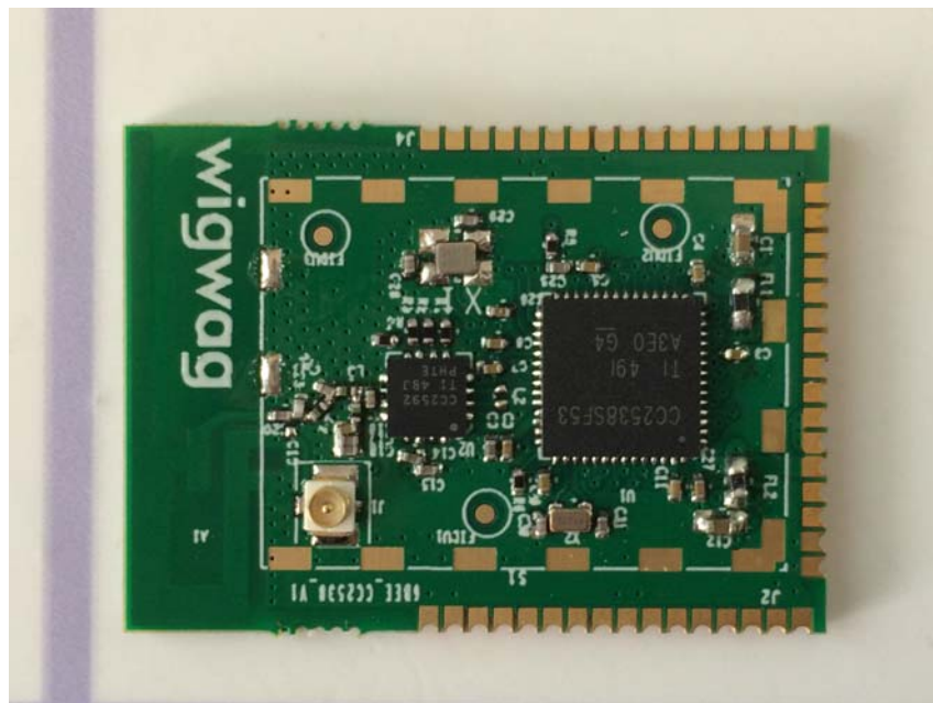
PCB Side 1 View

Copyright of this report is owned by Centre of Testing Service and may not be reproduced other than in full except with the written approval of the issuing Company.