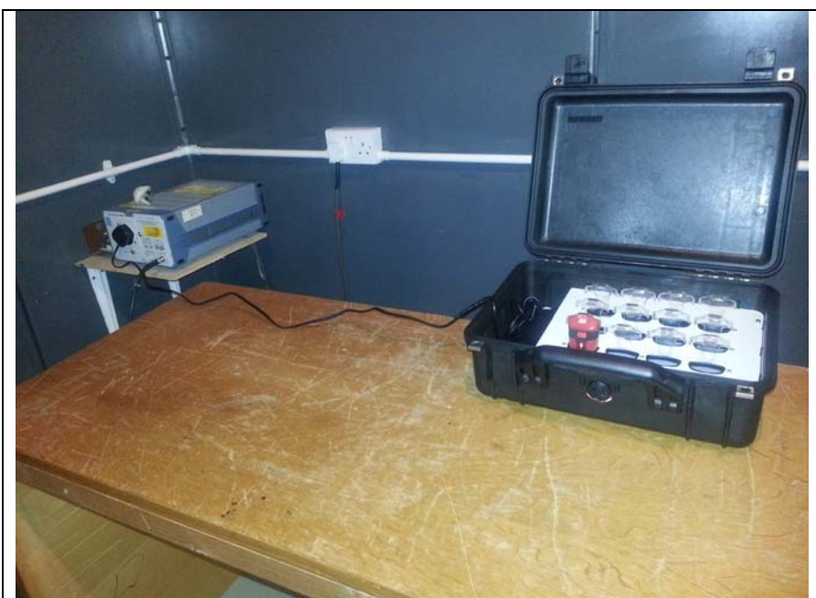
Fig 6 Test setup Conducted Emissions on mains through charger dock