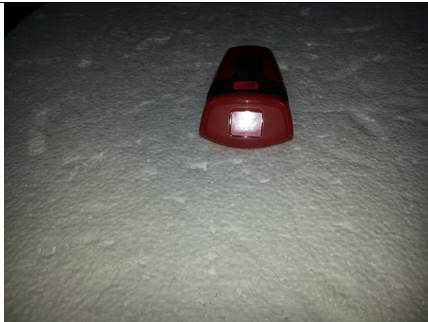
Fig 2 Test setup