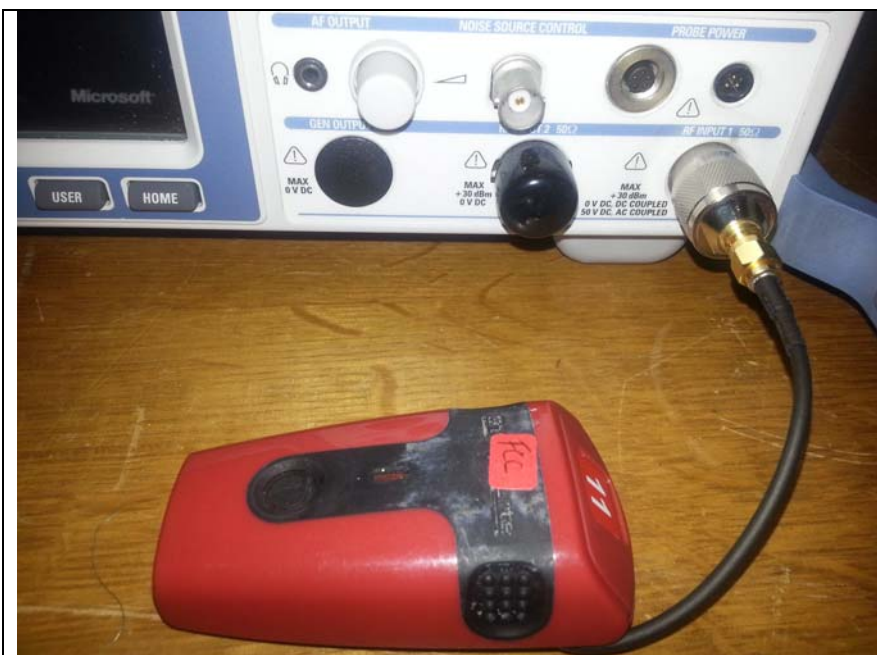
Fig 4 Test setup Conducted measurements