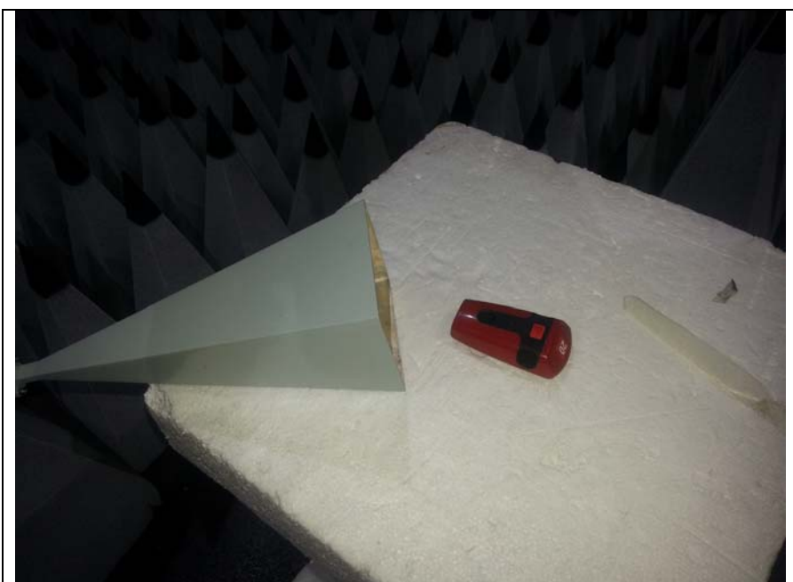
Fig 5 Test setup 18GHz- 26GHz Rad Emission 0.1metre