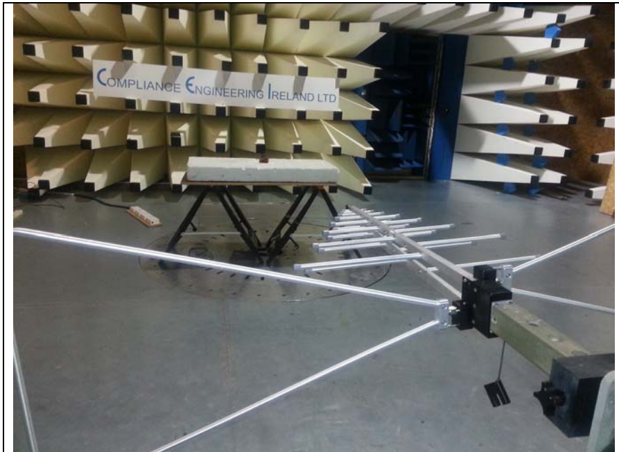
Fig 1 Test setup 30MHz -1GHz Rad Emission 3 metres