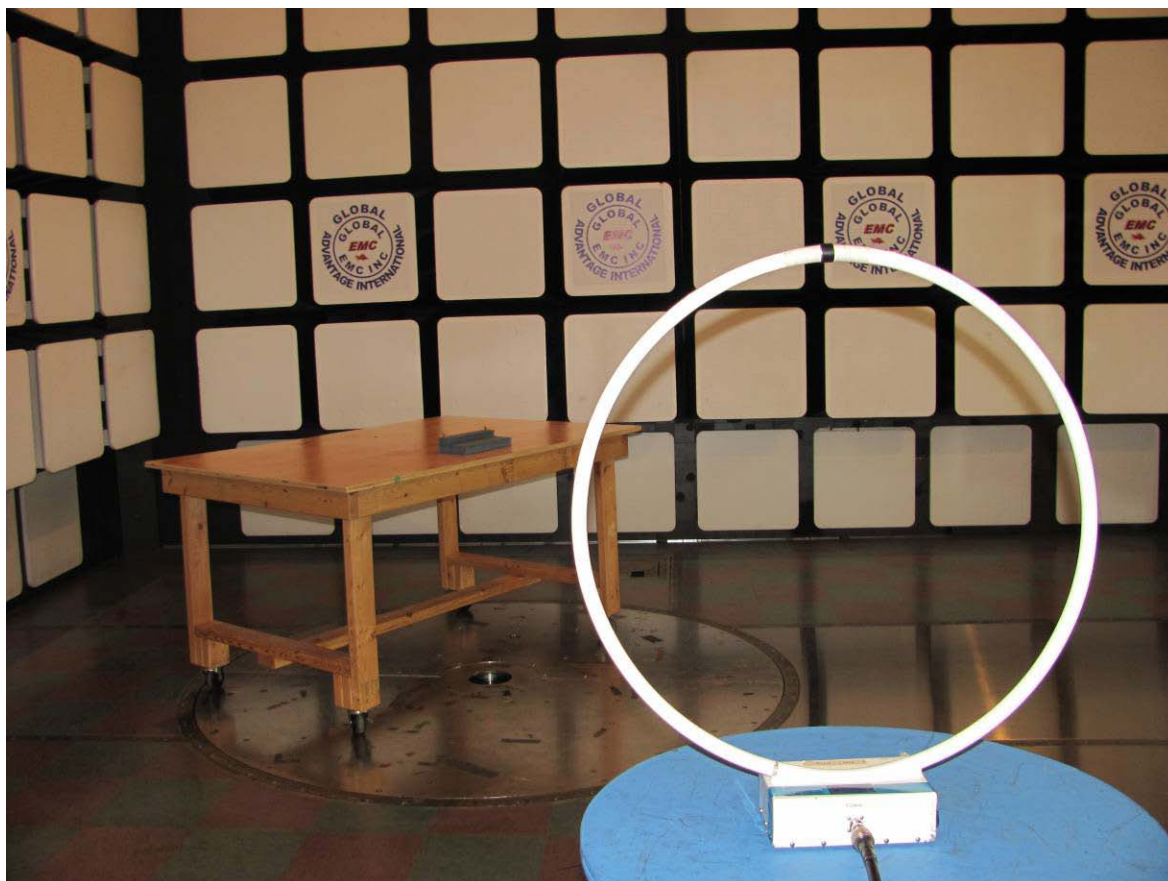
Figure 1: Radiated emission setup – photo 1