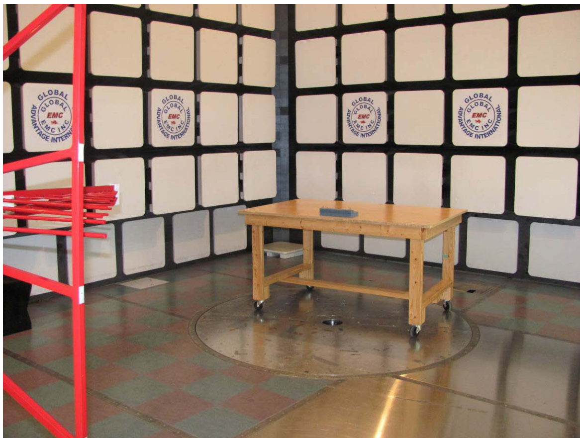
Figure 2: Radiated emission setup – photo 2