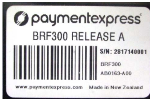
External View Device Under Test