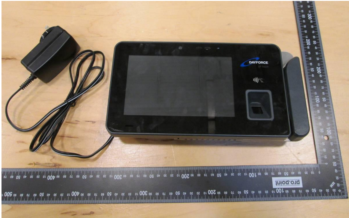
EUT – External view, side 1 (With power supply)