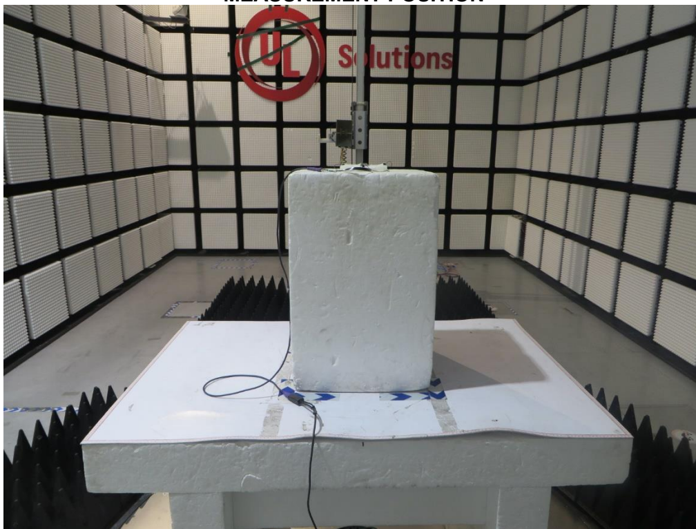
MEASUREMENT POSITION (X axis)