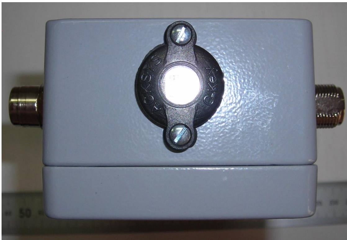
Figure 5: LH Side Chassis