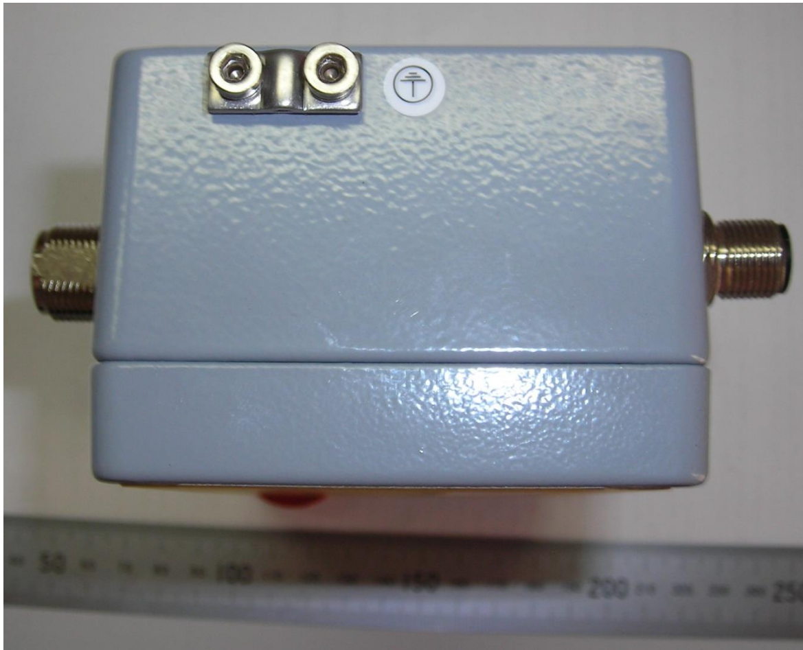
Figure 4: Chassis RH Side