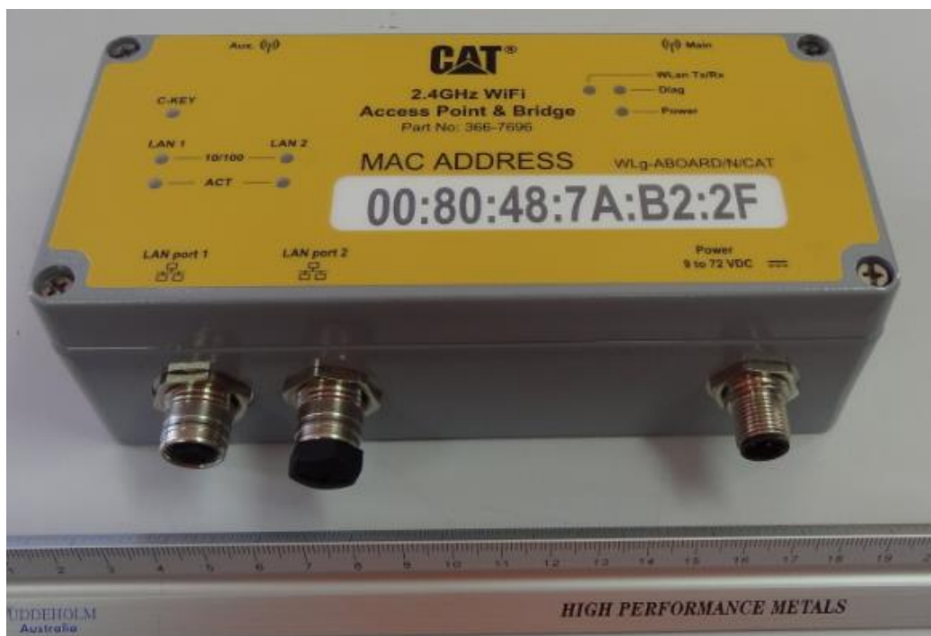
Figure 1: Chassis Top