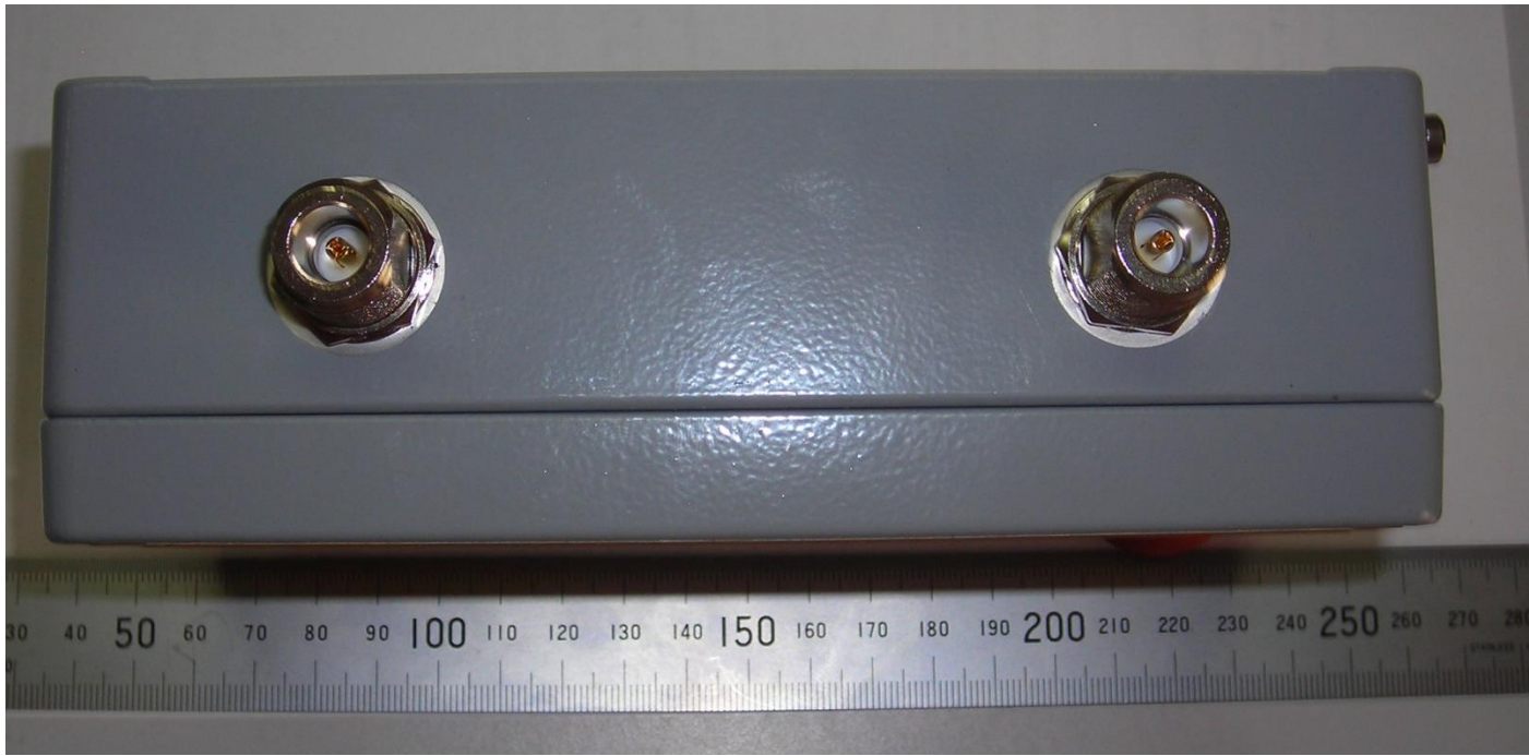
Figure 2: Front Chassis