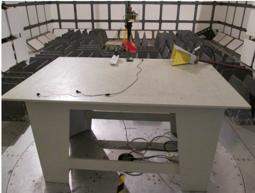
Radiated Emissions - Rear View (1-25 GHz)