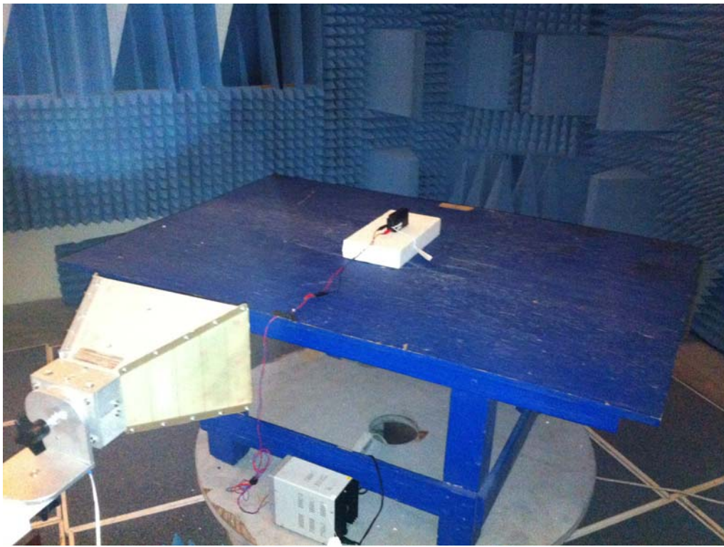
Power, Power Spectral Density, Bandwidth and Timings