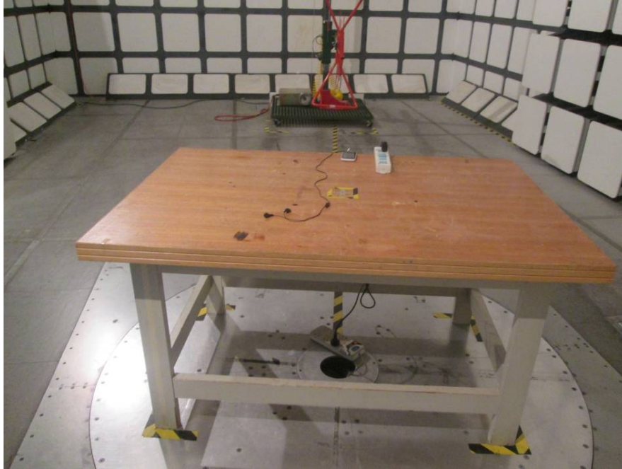
Radiated Emissions –Side View (30-1000 MHz)