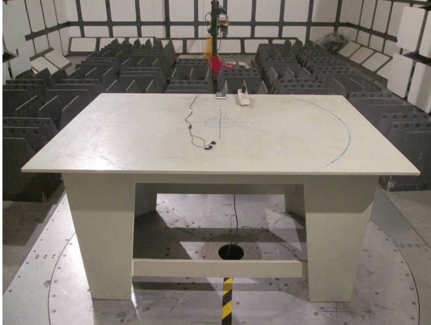
Radiated Emissions –Side View (1-25 GHz)