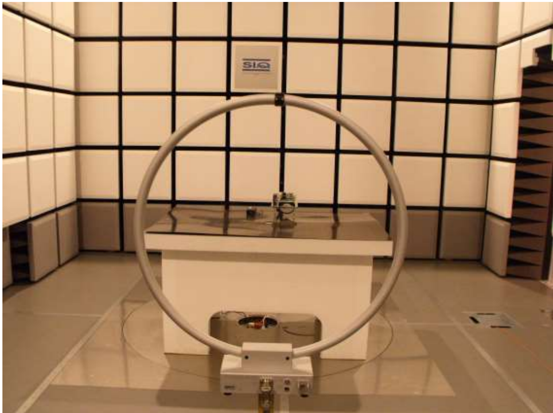
Figure 5: Radiated emission test from 9 kHz to 30 MHz in SAC