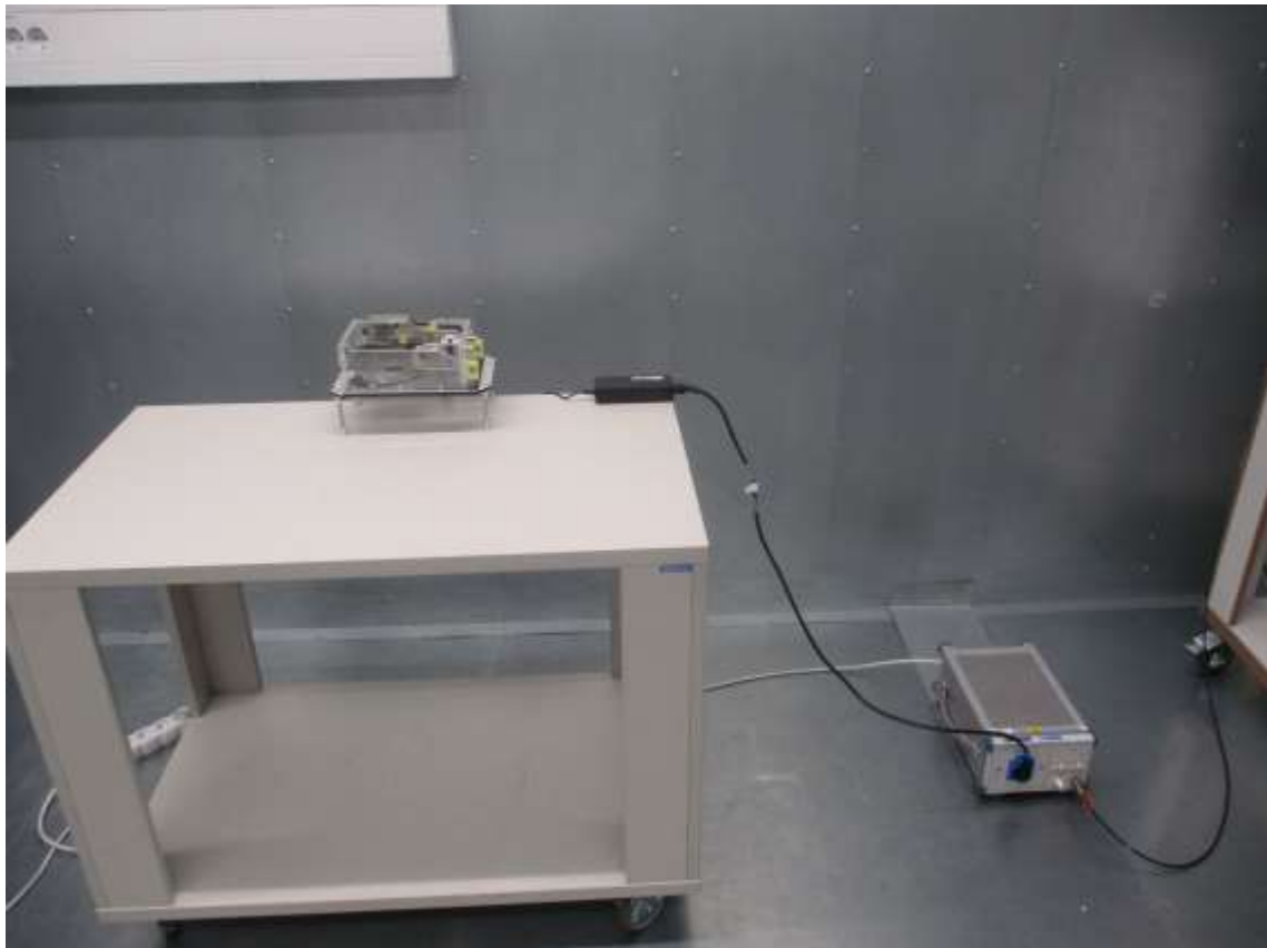
Figure 1: Conducted emission test