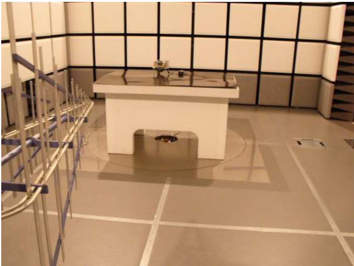
Figure 4: Radiated emission test from 200 MHz to 1 GHz in SAC