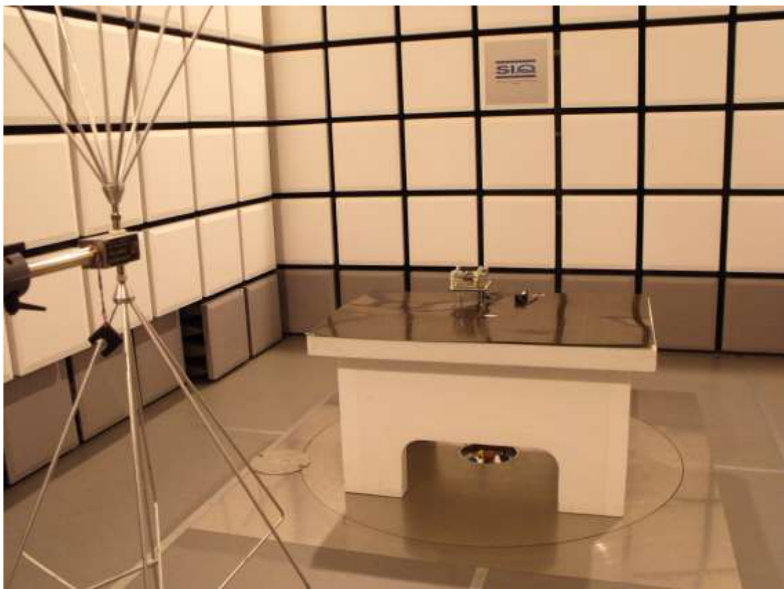
Figure 2: Radiated emission test from 30 MHz to 200 MHz in SAC