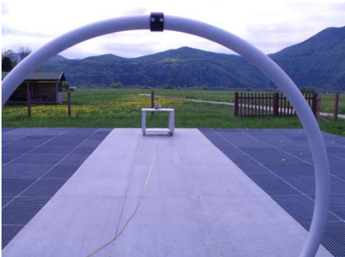
Figure 6: Radiated emission test from 9 kHz to 30 MHz on OATS