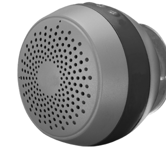
Bluetooth Speaker User's Guide for Model No. ISBW105 FCC ID:2ABQOAMK-S3-02B