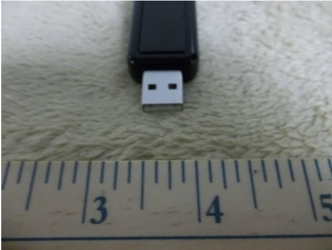
Figure 5. Front of EUT

FCC Part 15 Certification/ RSS 210 2ABLX-QM150402FM 8832A-QM150402FM 15-0240 October 1, 2015 Qmotion Incorporated QM150402FM