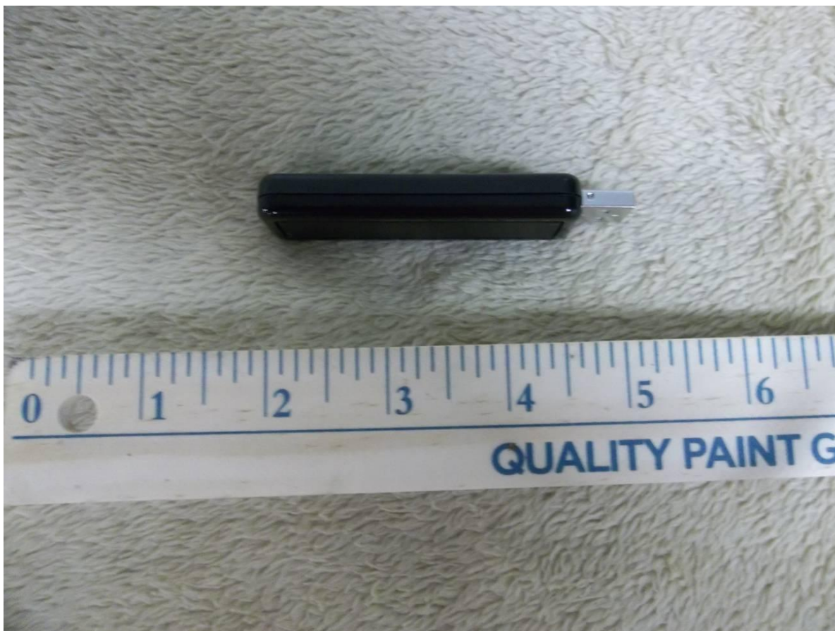
Figure 4. Right Side of EUT

FCC Part 15 Certification/ RSS 210 2ABLX-QM150402FM 8832A-QM150402FM 15-0240 October 1, 2015 Qmotion Incorporated QM150402FM