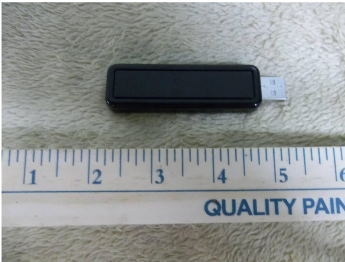
Figure 2. Bottom of EUT

FCC Part 15 Certification/ RSS 210 2ABLX-QM150402FM 8832A-QM150402FM 15-0240 October 1, 2015 Qmotion Incorporated QM150402FM