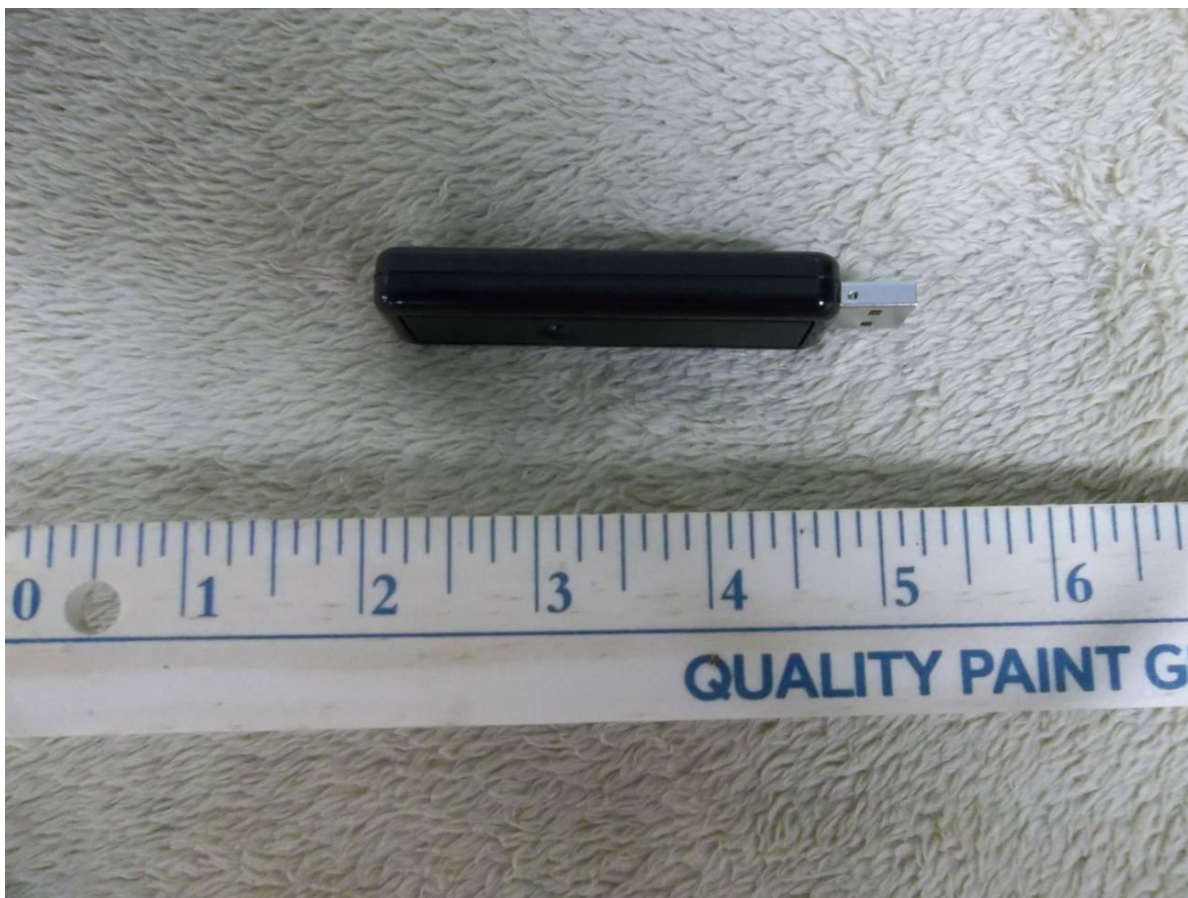
Figure 3. Left Side of EUT

FCC Part 15 Certification/ RSS 210 2ABLX-QM150402FM 8832A-QM150402FM 15-0240 October 1, 2015 Qmotion Incorporated QM150402FM