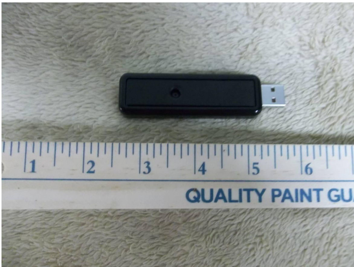
Figure 1. Top of EUT