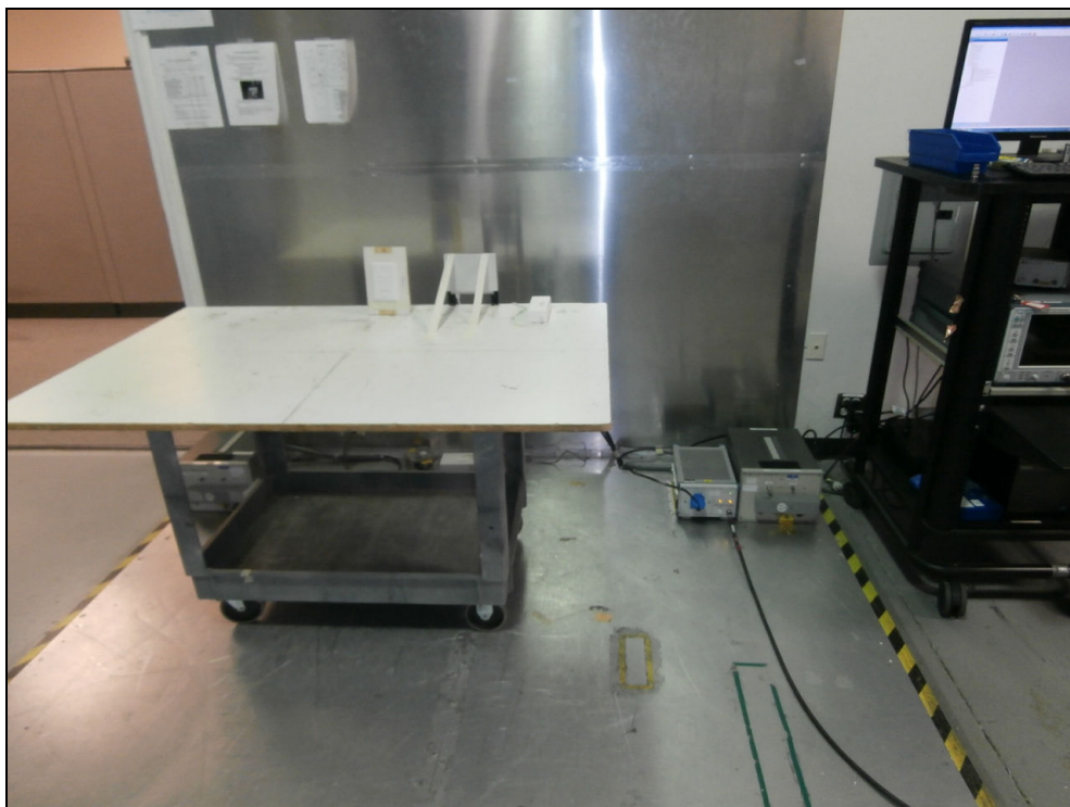
Figure 4: Conducted Emissions