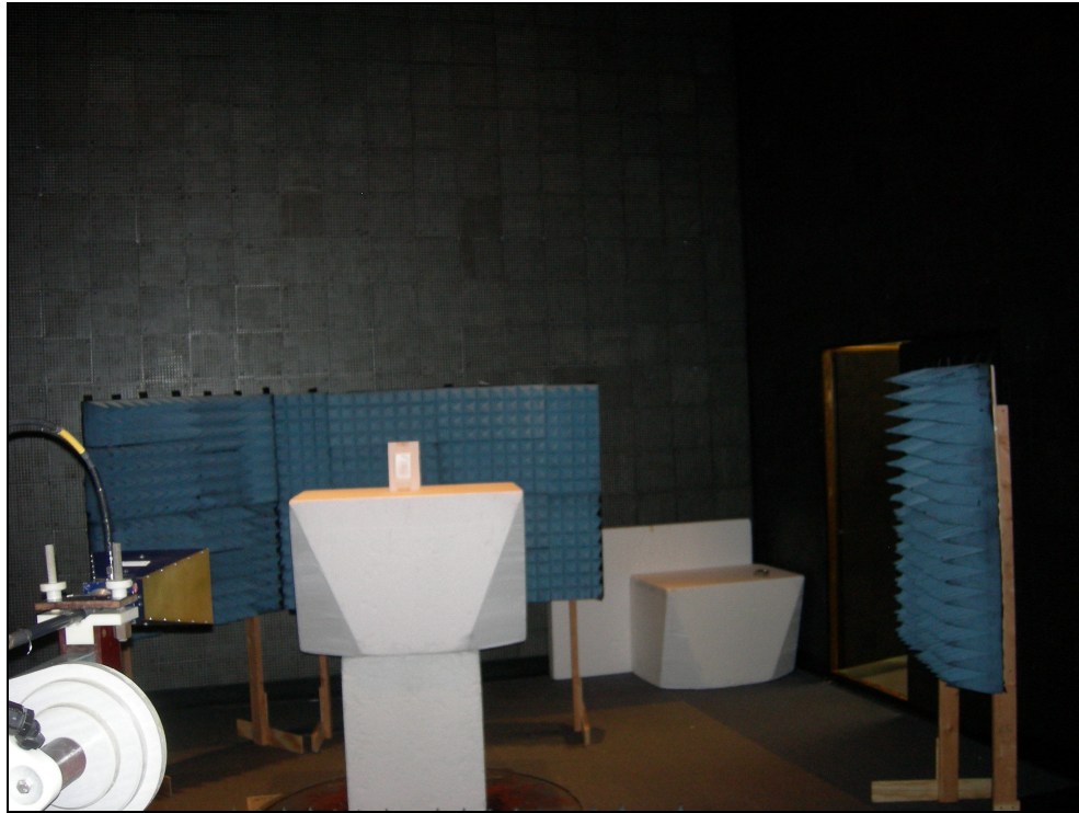
Figure 3: Radiated Emissions