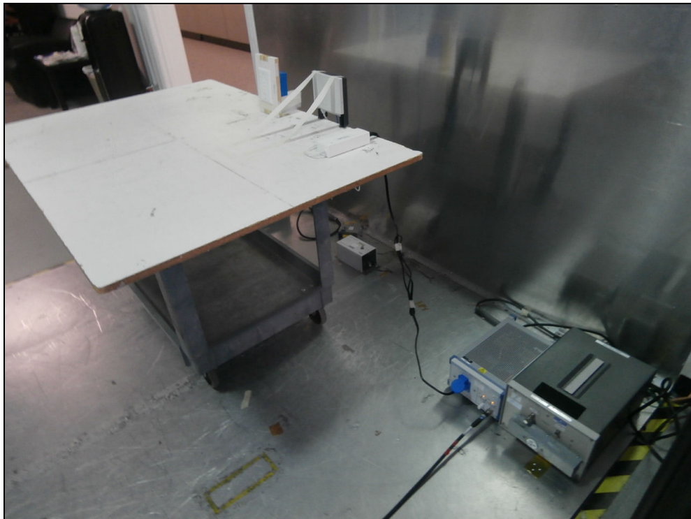
Figure 5: Conducted Emissions