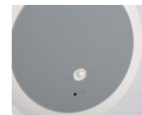
Bluetooth Power ON/OFF