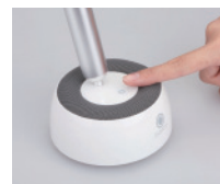
Lamp Power ON/OFF