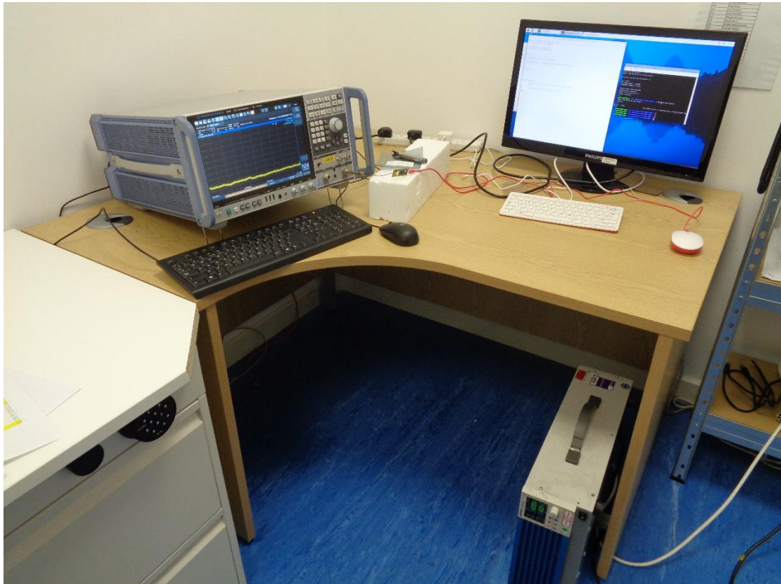
Arrangements for conducted tests – antenna port (Output power, conducted spurious, occupied bandwidth etc.)