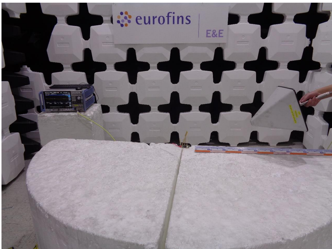
Investigative measurements 1-18GHz