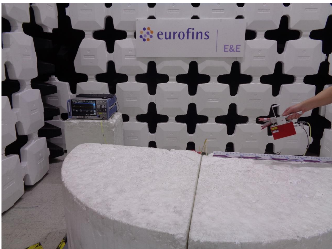
Investigative measurements 18-26GHz