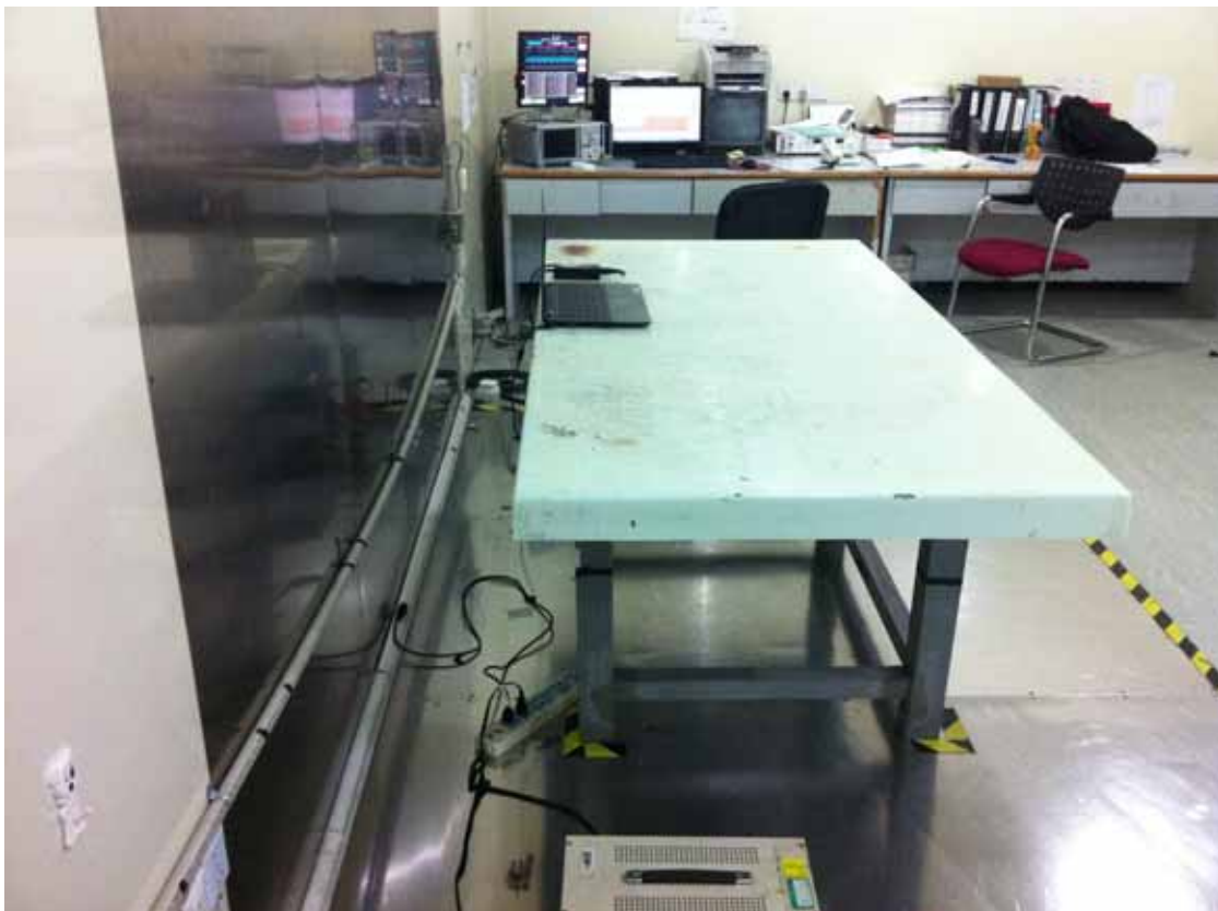
Side View of Conducted Disturbance Measurement