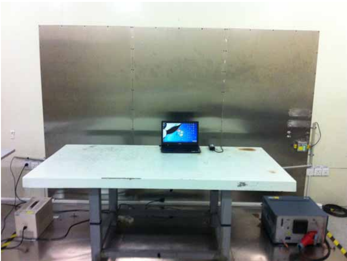
Front View of Conducted Disturbance Measurement