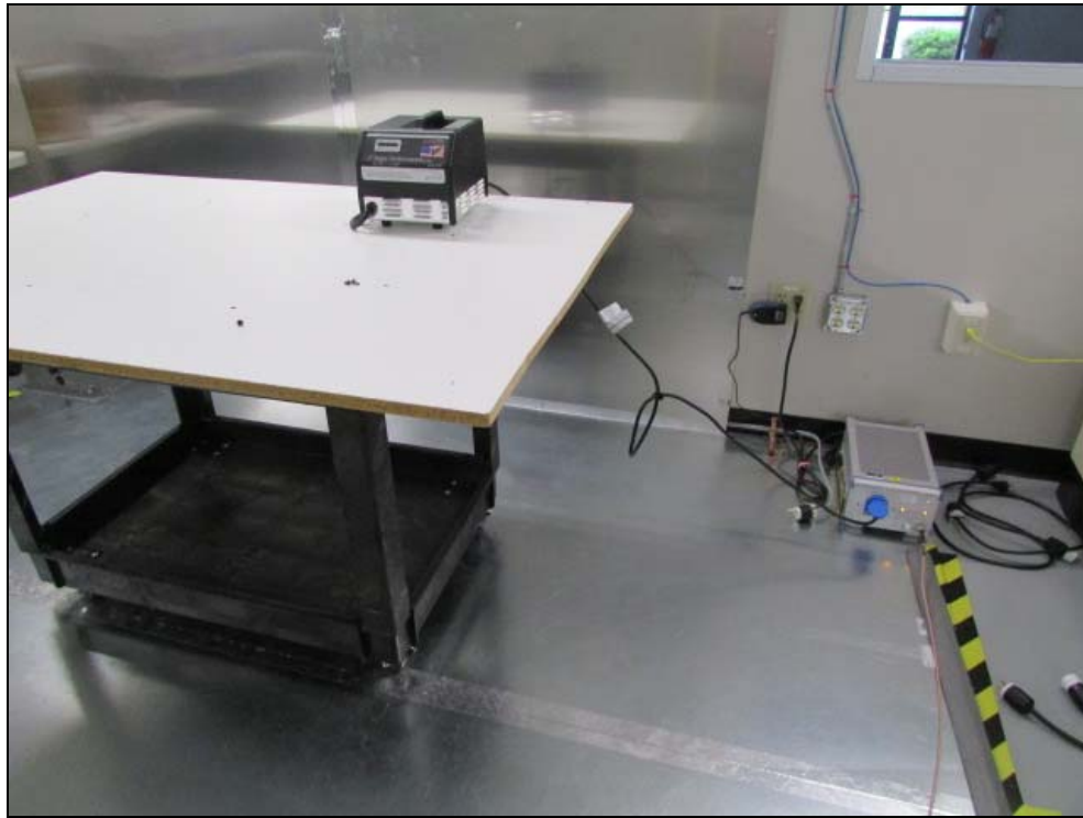
Figure 3: Power Line Conducted – Front View