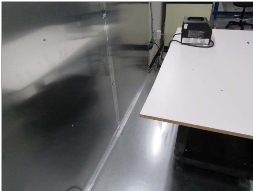
Figure 4: Power Line Conducted – Side View