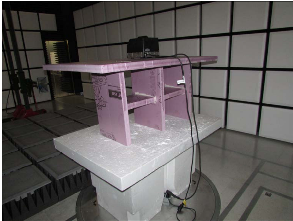
Figure 1: 48VDC Host - Back