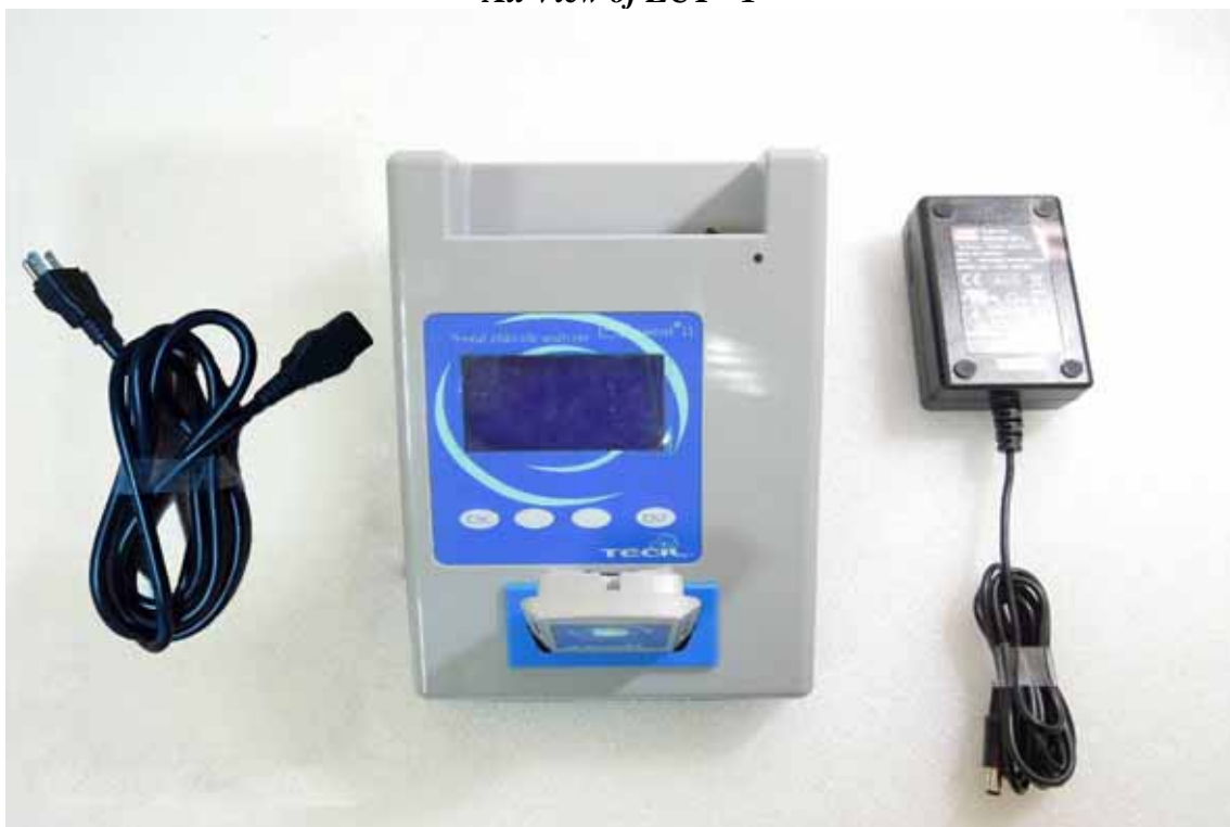
All View of EUT - 2