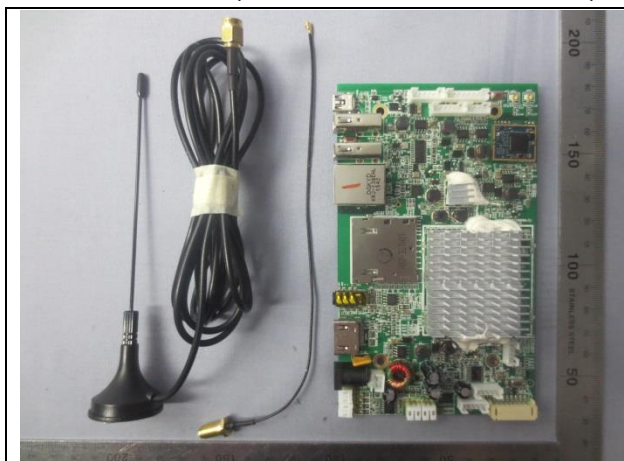
Limited modular with antenna

Photo of limited modular (FCC ID: 2AB6Z-1859ATMBA-V2)