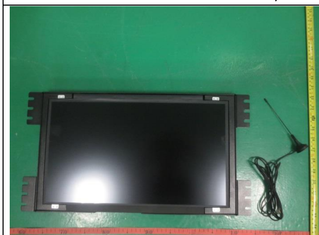
Top view with antenna

Product: 17.3" Quad Core Media Player Slim Housing (Non-touch) (Project: CCISE1605039)