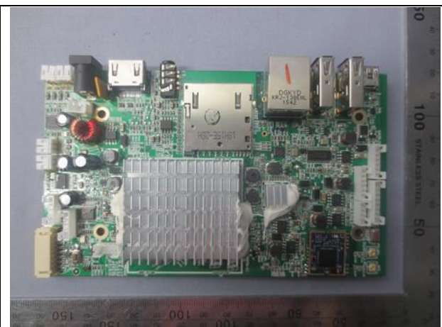
Top view of limited modular