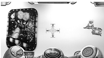
Look out for the raging Aliens on radar (red dots)