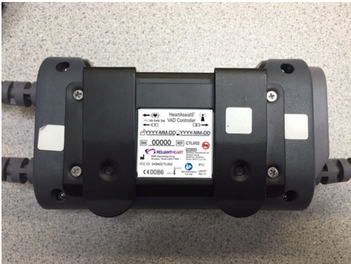
Label Placement For reference only