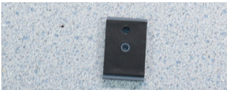
Figure 31- SIM card cover with gasket applied