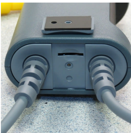
Figure 32- Right housing shown without the SIM card cover