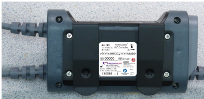
Figure 30- Belt clip fastened to the rear housing with label applied.