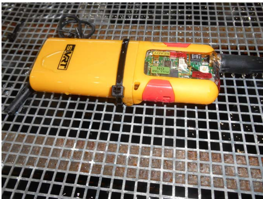
SPECIMEN TRA-021534-S2 REMOVED FROM WATER FOR INSPECTION