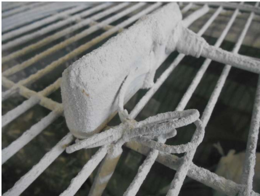
SPECIMEN TRA-021534-S1 AFTER UNDERGOING IP6X DUST TEST