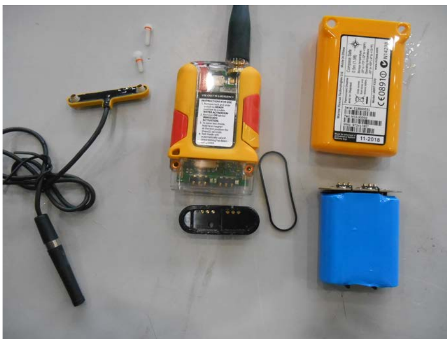
SPECIMEN TRA-021534-S2 INSPECTED FOR WATER INGRESS