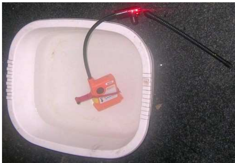
Figure A.2 – Water activation