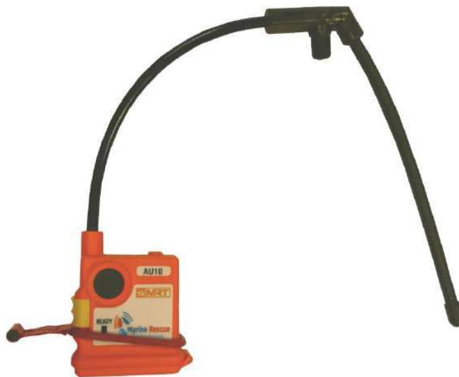
MRT AU9-AIS / AU10

The AU10 (formerly known as the AU9-AIS) is a dual-operation personal MOB Alerting Unit (AU) transmitting on 121.5 MHz SAR frequency, whilst simultaneously sending GPS position information on maritime AIS channels AIS1 & AIS2.