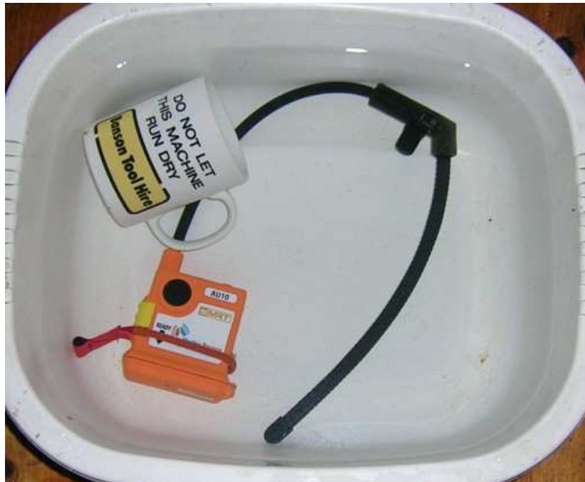
Figure A.1 – Thermal shock submersion in water