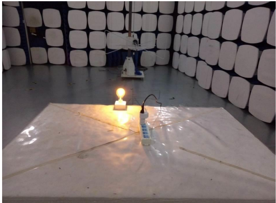
Radiated emission – above 1GHz