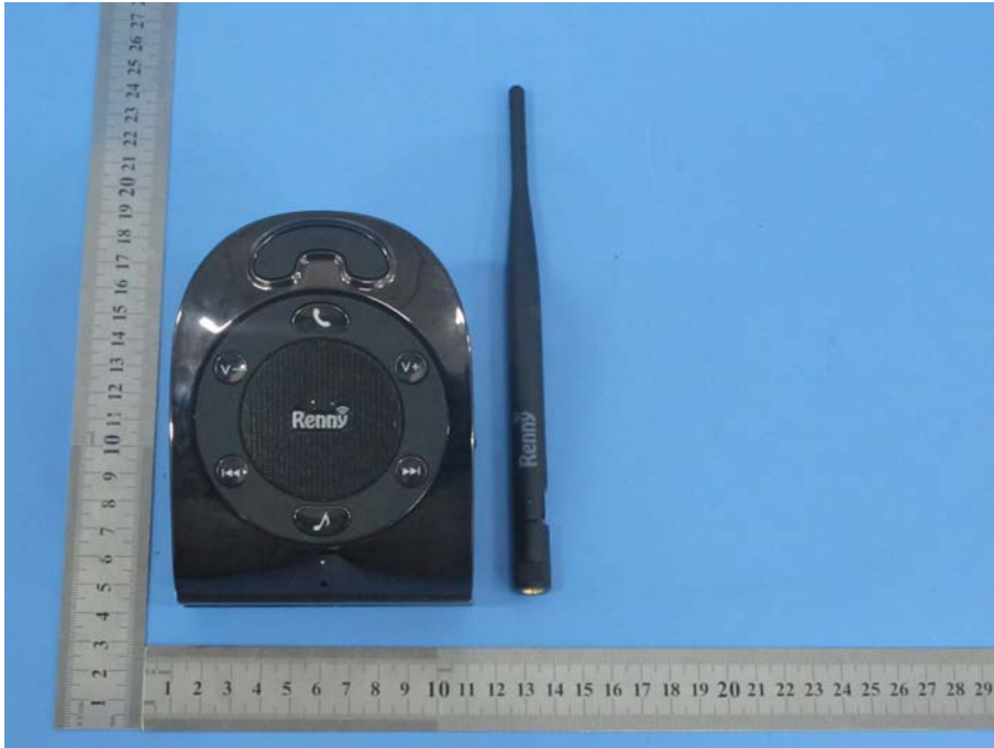
Photo 2 Appearance of EUT