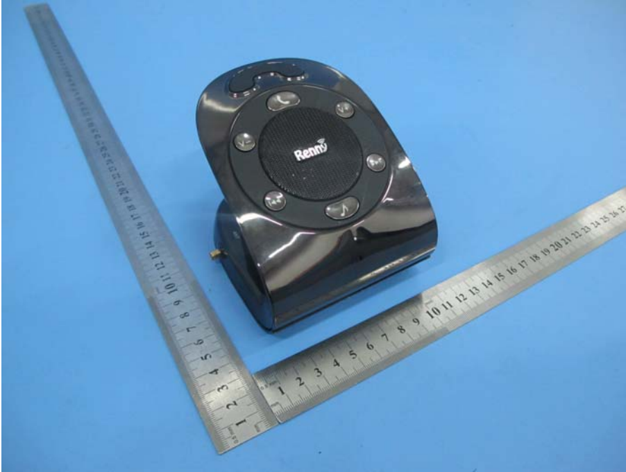
Photo 4 Appearance of EUT