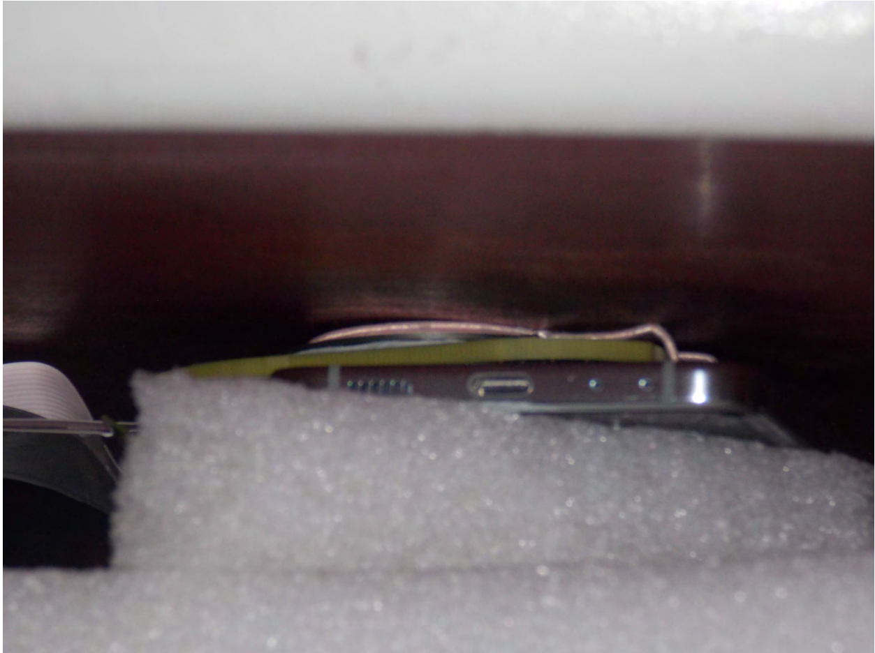
Test Position Front