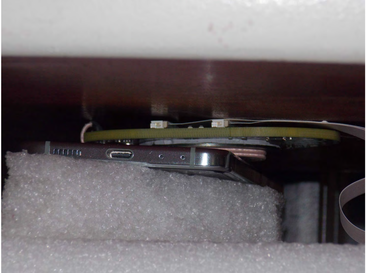
Test Position Back