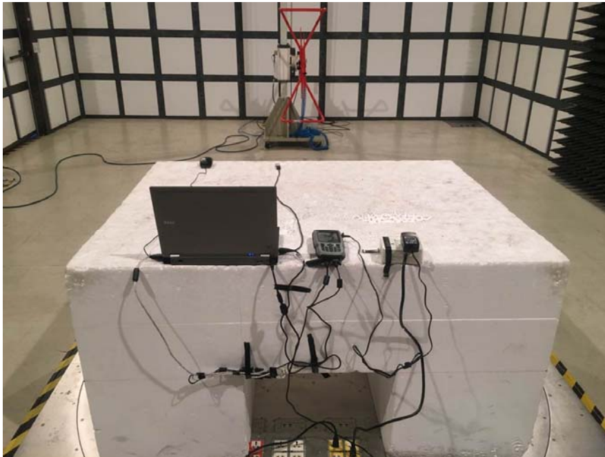
Radiated Emissions- Rear View (Below 1G)