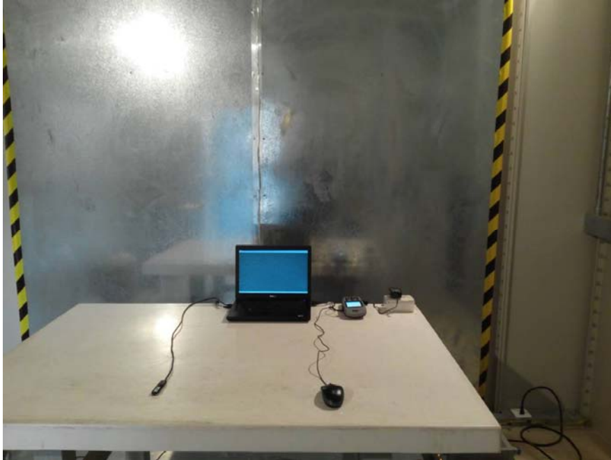
Conducted Emissions- Rear View