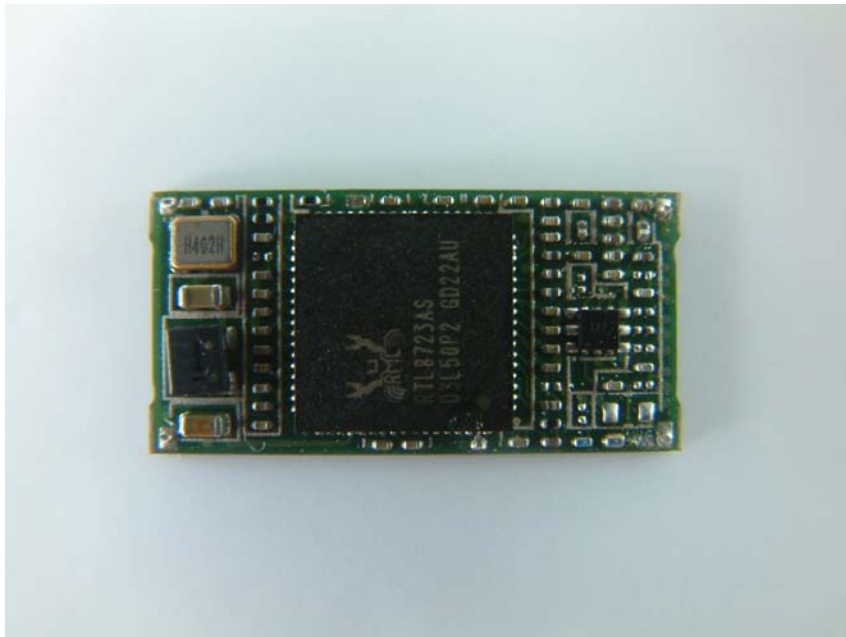
PCB view side 1

Copyright of this report is owned by Centre of Testing Service and may not be reproduced other than in full except with the written approval of the issuing Company.