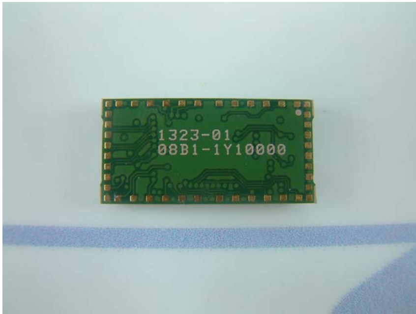
PCB view side 2