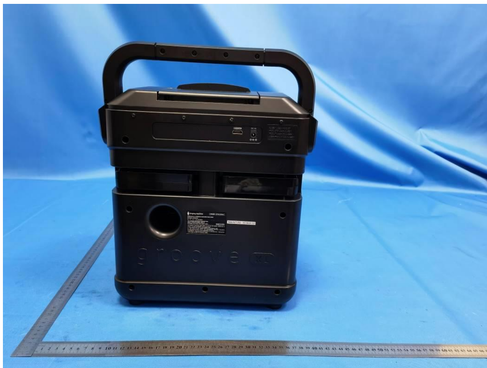
FRONT VIEW OF EUT