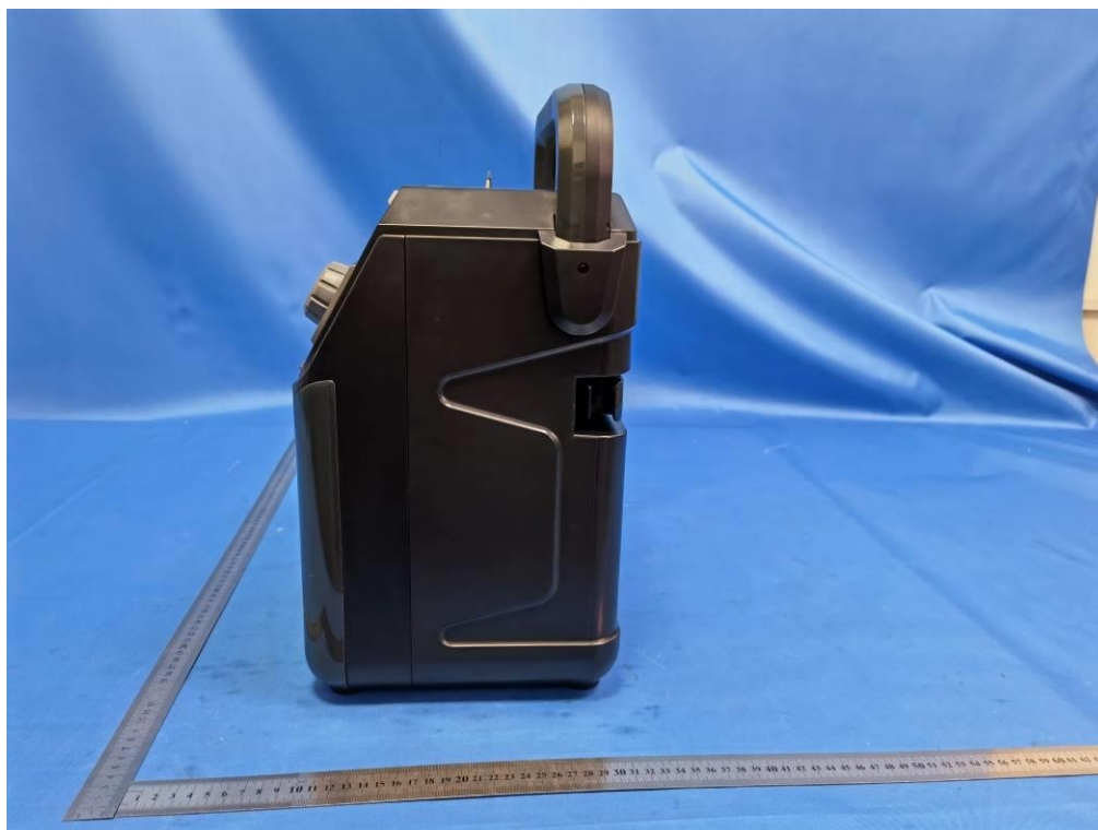
PORT VIEW OF EUT (FIGURE 1)