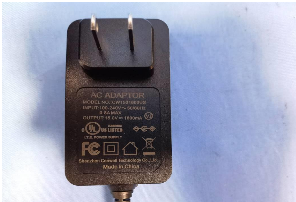
ADAPTER CLOSE-UP PHOTO-2