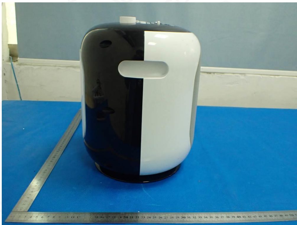
PORT VIEW OF EUT