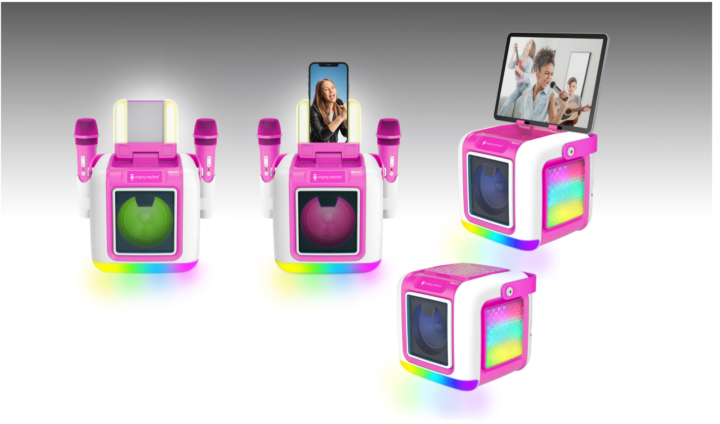
Cosmetic is for reference only