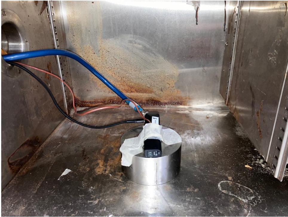
Figure 1 Radiated emission test