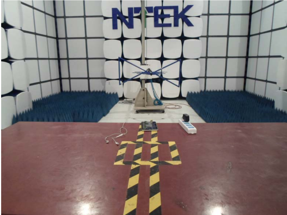
Radiated Measurement Photos (1000-6000MHz)